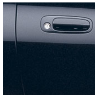
CARBON BLUE with Black (GT-S 1 ) or Black/Silver (GT) interior