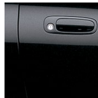
BLACK with Black (GT-S 1 ), Black/Red or Black/Silver (GT) interior