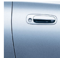
ZEPHYR BLUE METALLIC with Black (GT, GT-S 1 ) interior