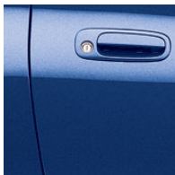
SPECTRA BLUE MICA with Black (GT-S 1 ) or Black/Silver (GT) interior