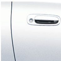
SUPER WHITE with Black (GT-S 1 ) or Black/Silver (GT) interior