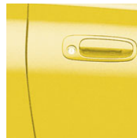
SOLAR YELLOW with Black (GT, GT-S 1 ) interior