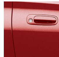
ABSOLUTELY RED with Black (GT-S 1 ) or Black/Red (GT) interior