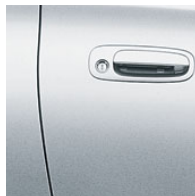
SILVER STREAK MICA with Black (GT-S 1 ) or Black/Silver (GT) interior