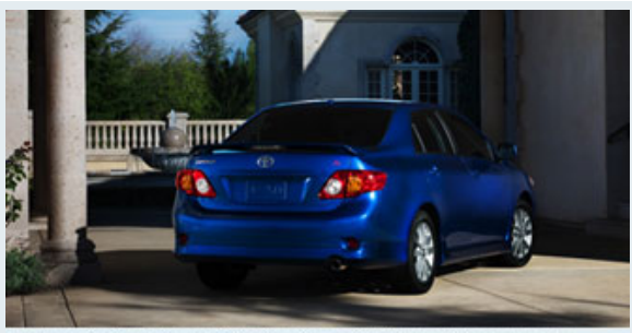
S shown in Blue Streak Metallic with available Sport Package and available moonroof