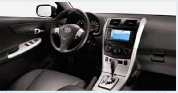
XRS interior shown in Dark Charcoal with available touch-screen DVD navigation system [9] [7] [5], Power Package, and Leather Trim Package [7]