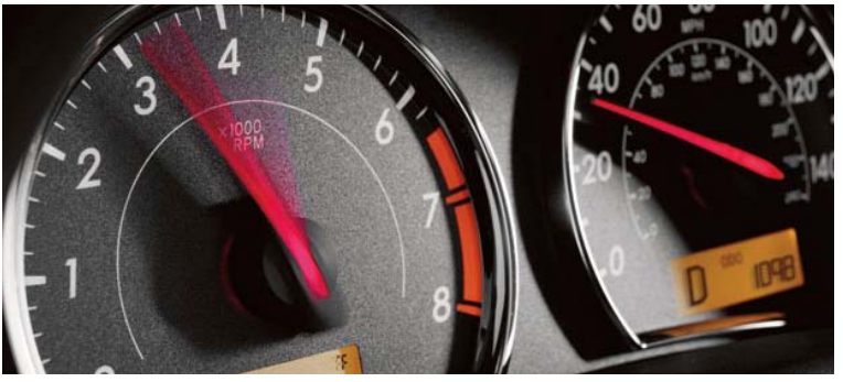
1. See footnote 3 in Disclaimers section. 2. Manual transmission only.

Corolla's Multi-Information Display (MID) keeps the driver informed. In addition to vehicle speed and engine rpm gauges, the MID also provides outside temperature, instant fuel economy, average fuel economy, average speed and travel distance.