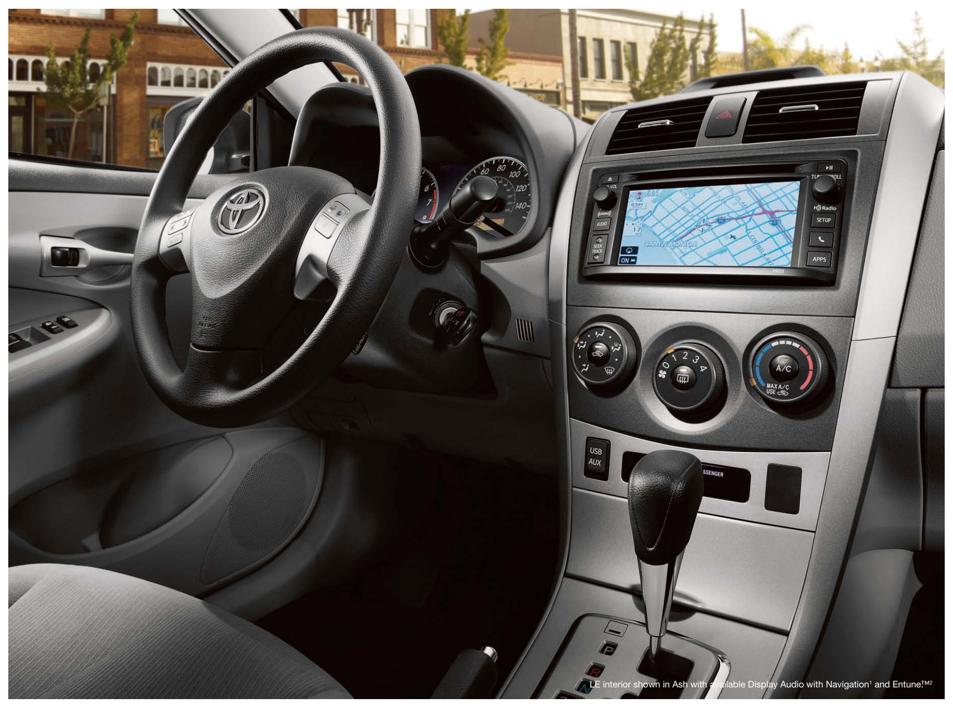
1. See footnote 10 in Disclaimers section. 2. See footnote 11 in Disclaimers section.