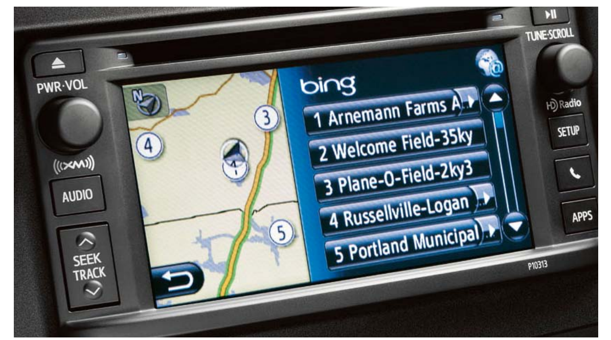
1. See footnote 10 in Disclaimers section. 2. See footnote 11 in Disclaimers section. 3. See footnote 5 in Disclaimers section. 4. See footnote 12 in Disclaimers section. 5. See footnote 13 in Disclaimers section. 8. See footnote 9 in Disclaimers section. 8. See footnote 9 in Disclaimers section.

Corolla is available with Bluetooth ® wireless technology. Its voice-recognition capability allows you to operate your compatible cell phone with your hands on the wheel. It also lets you stream music from your compatible Bluetooth ®-enabled device directly to the available Display Audio with Navigation and Entune!™