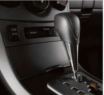
1. See footnote 10 in Disclaimers section. 2. See footnote 11 in Disclaimers section.

With its available rich, textured leather trim and eye-catching chrome accents, Corolla's sporty shift knob is agreeable both to hold and to behold.