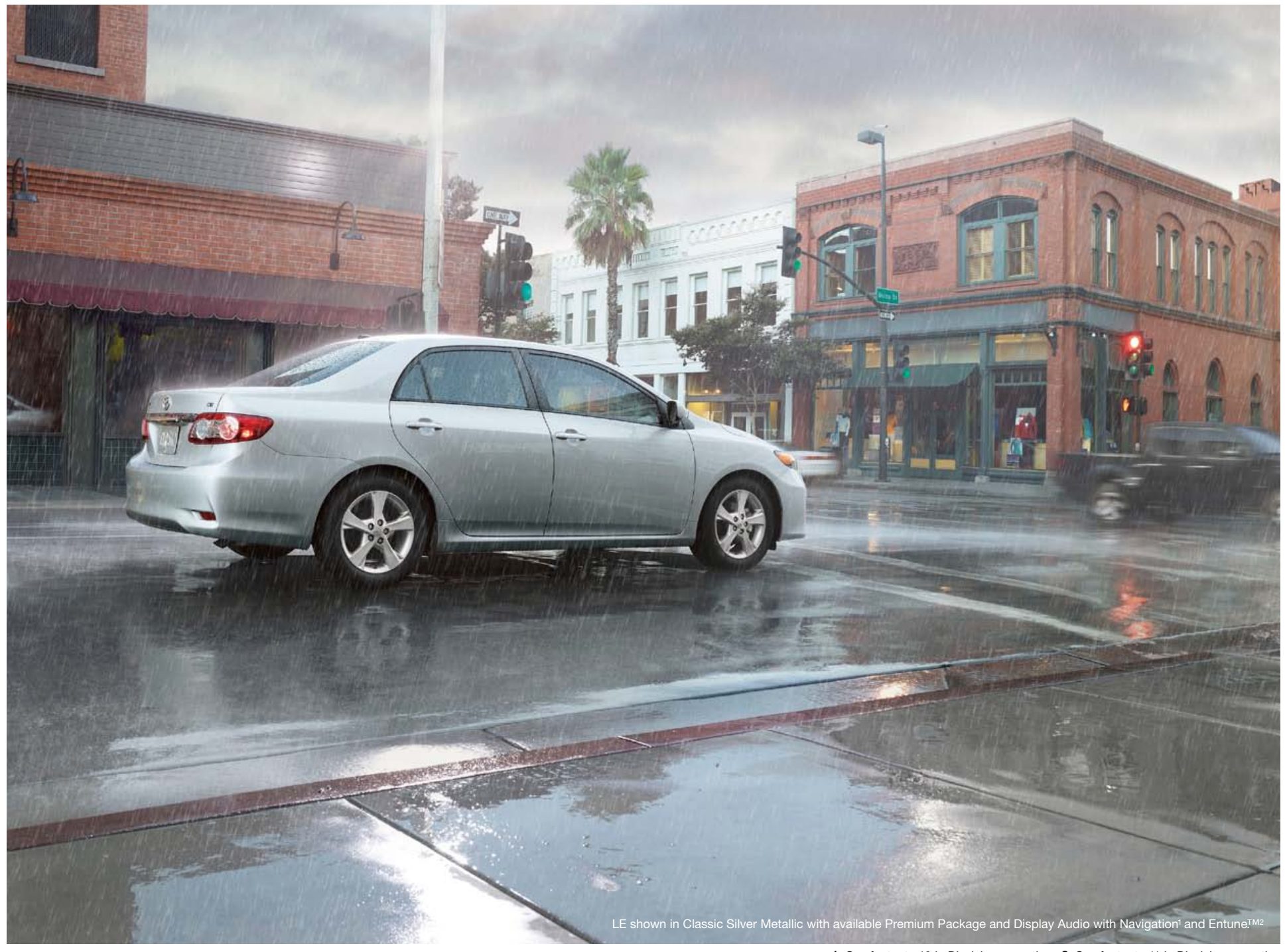
1. See footnote 10 in Disclaimers section. 2. See footnote 11 in Disclaimers section.