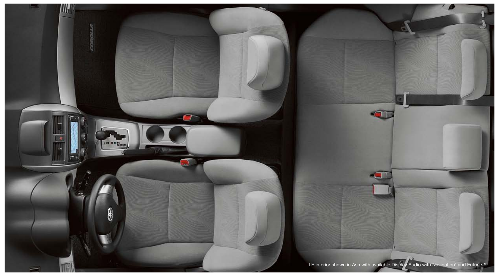
1. See footnote 10 in Disclaimers section. 2. See footnote 11 in Disclaimers section.