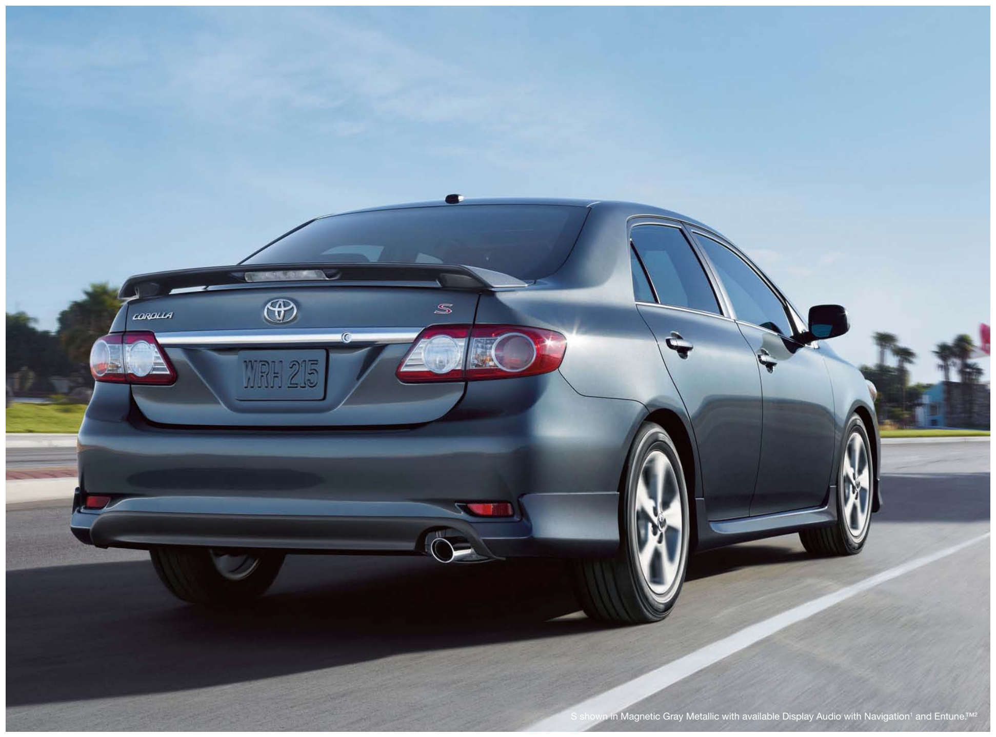
1. See footnote 10 in Disclaimers section. 2. See footnote 11 in Disclaimers section.