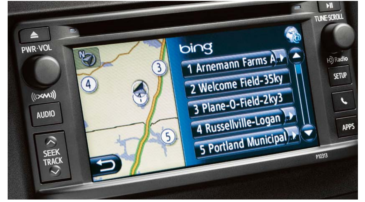
See footnote 11 in Disclosures section. See footnote 12 in Disclosures section. See footnote 6 in Disclosures section. See footnote 13 in Disclosures section. See footnote 14 in Disclosures section. See footnote 10 in Disclosures section.

Corolla is available with Bluetooth ® wireless technology. Its voice-recognition capability allows you to operate your compatible cell phone with your hands on the wheel. It also lets you stream music from your compatible Bluetooth ®-enabled device directly to the available Display Audio with Navigation and Entune®