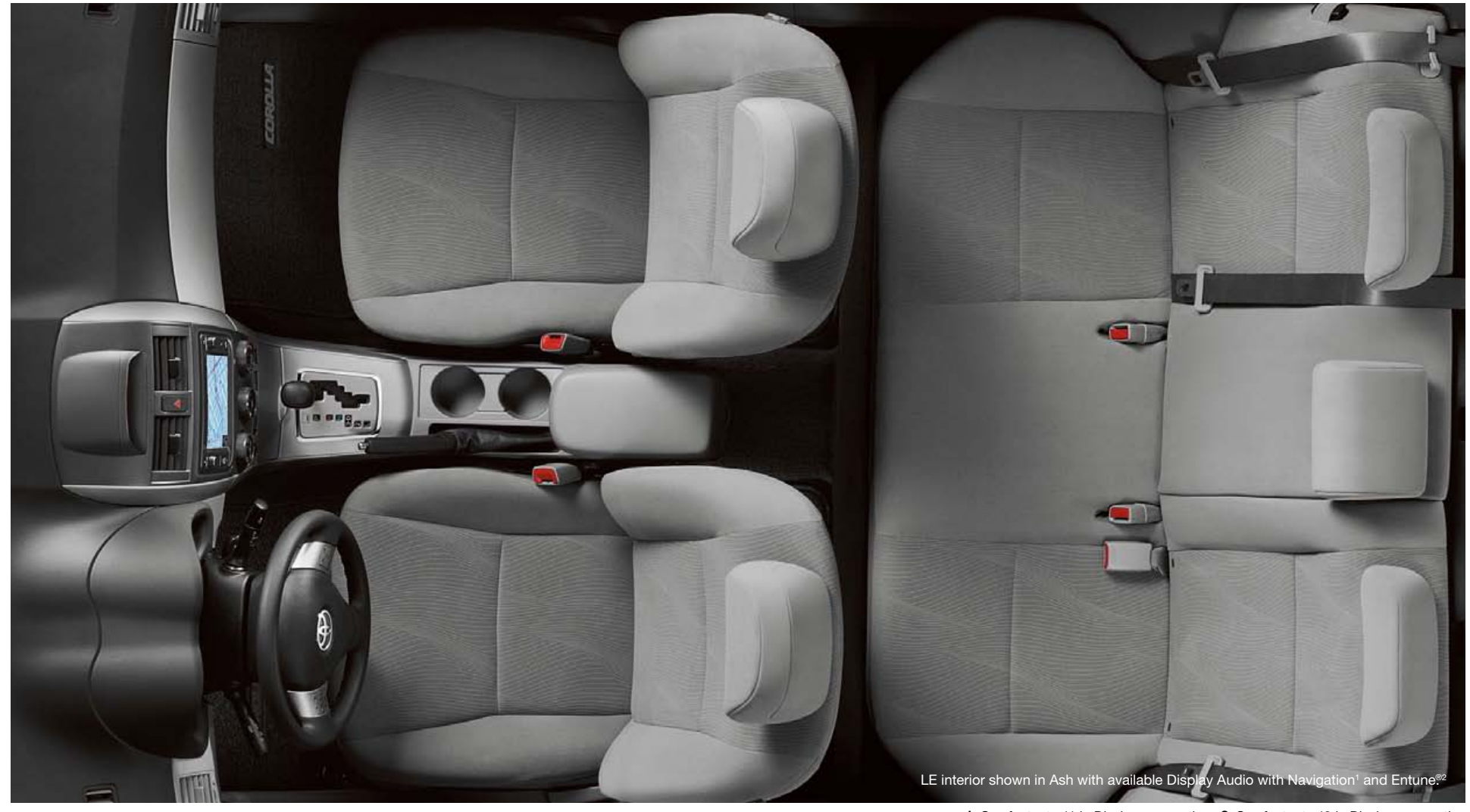
1. See footnote 11 in Disclosures section. 2. See footnote 12 in Disclosures section.