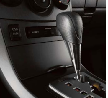
1. Requires Premium Package. 2. See footnote 11 in Disclosures section. 3. See footnote 12 in Disclosures section.

With its available rich, textured leather trim and eye-catching chrome accents, Corolla's sporty shift knob is agreeable both to hold and to behold.