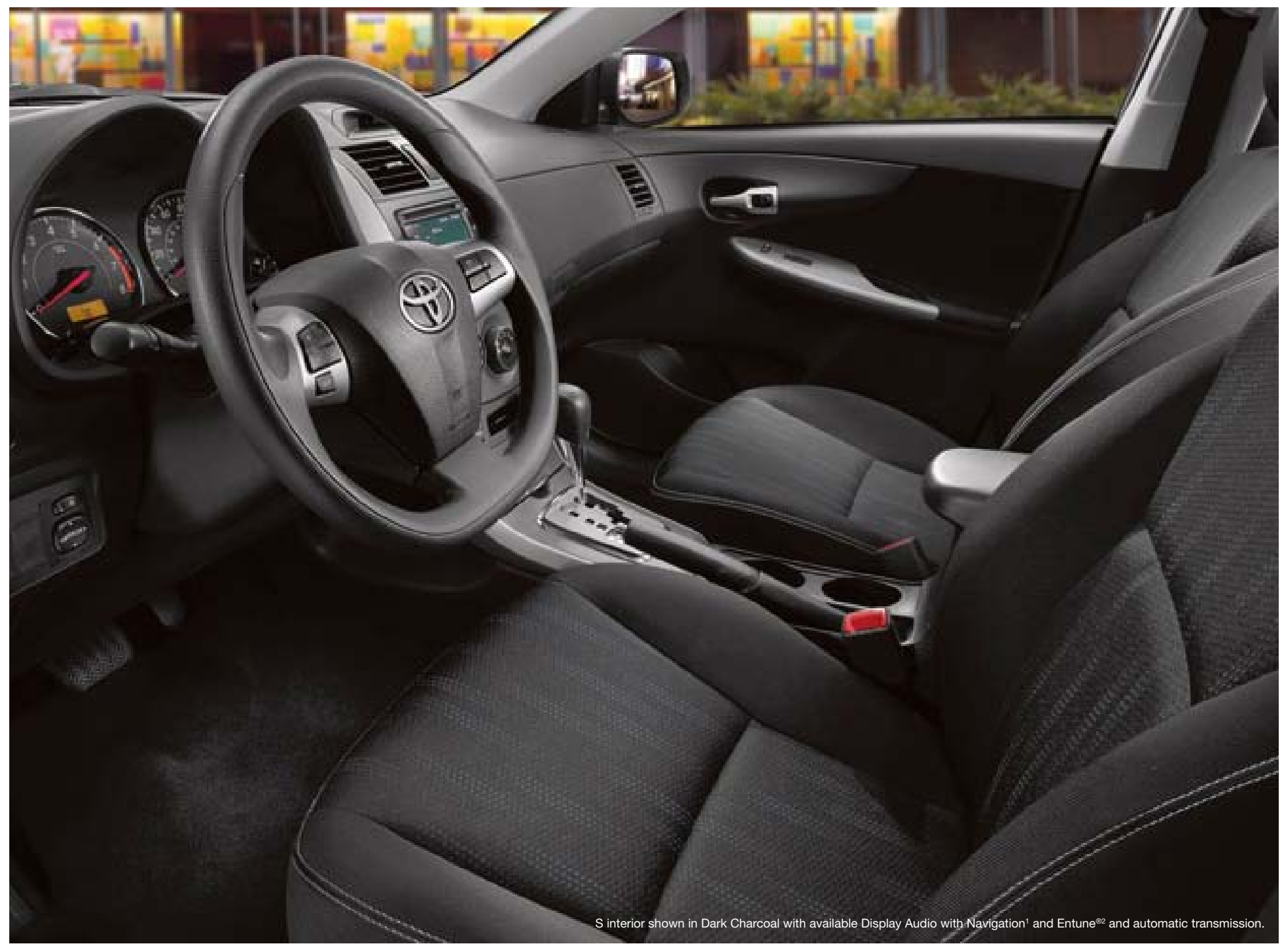
1. See footnote 10 in Disclosures section. 2. See footnote 11 in Disclosures section.