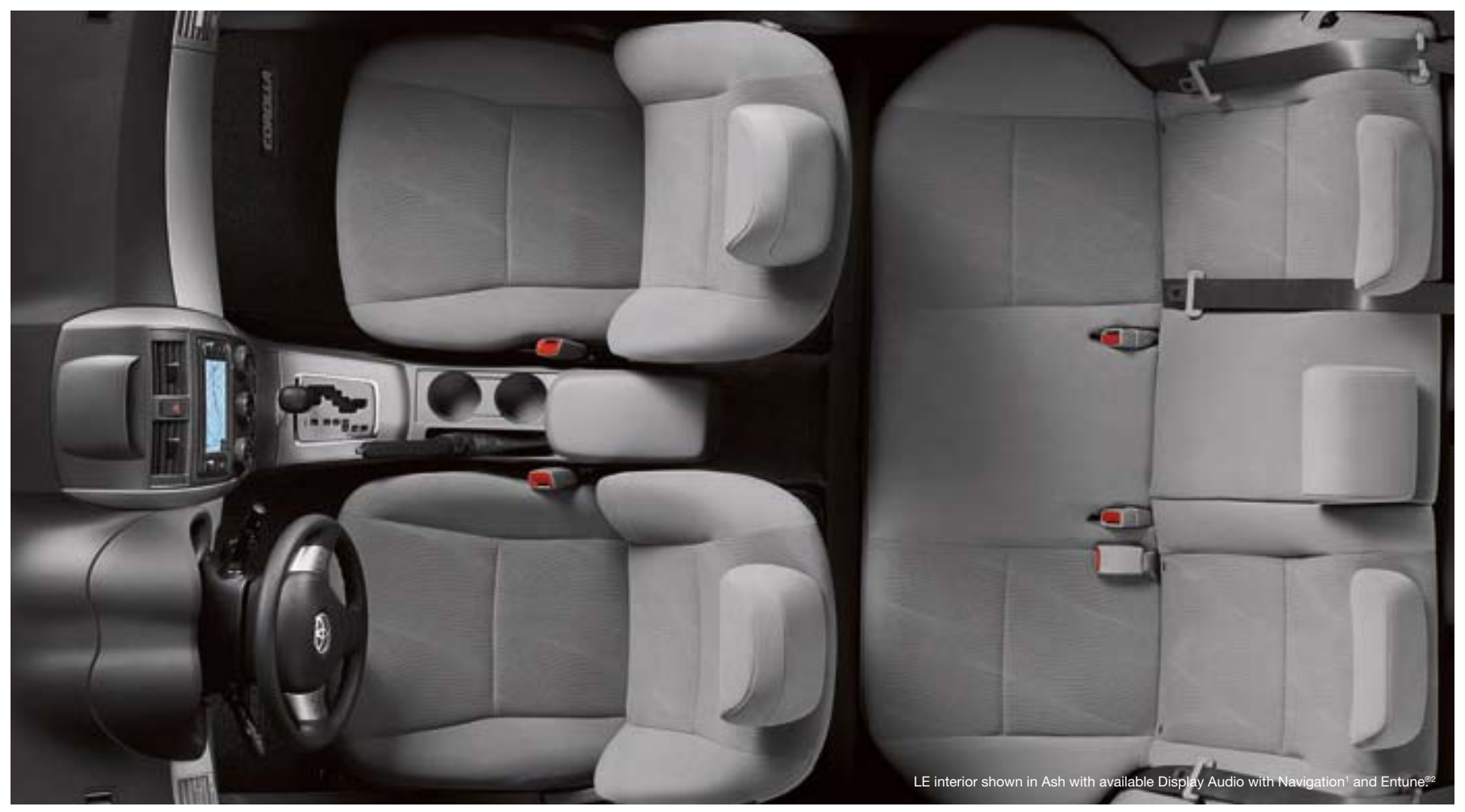
1. See footnote 10 in Disclosures section. 2. See footnote 11 in Disclosures section.