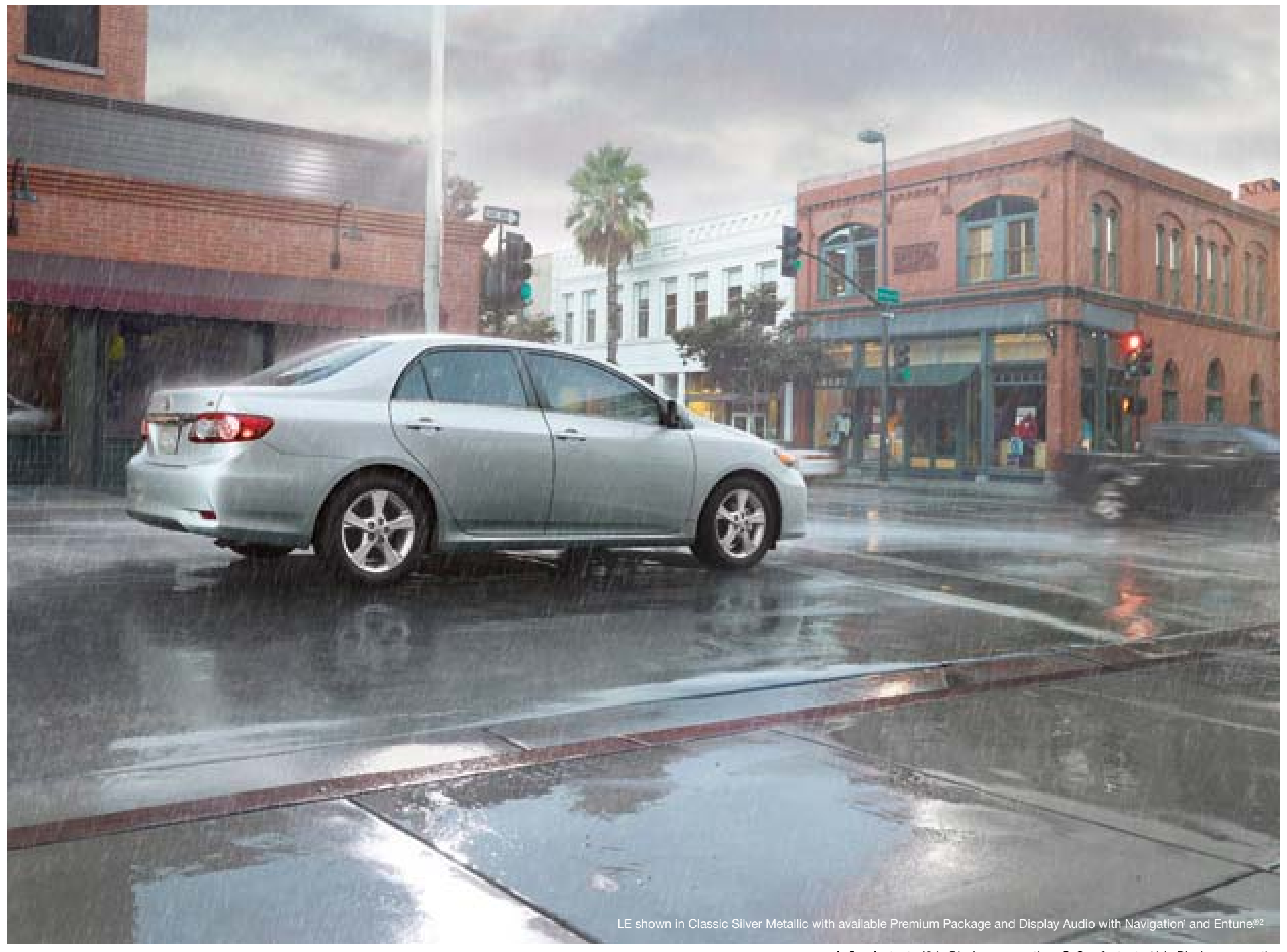
1. See footnote 10 in Disclosures section. 2. See footnote 11 in Disclosures section.