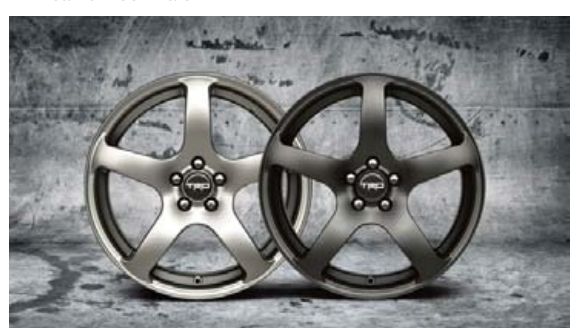
TRD 18-in. alloy wheels<sup>27</sup>