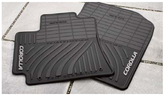
All-weather floor mats<sup>22</sup>