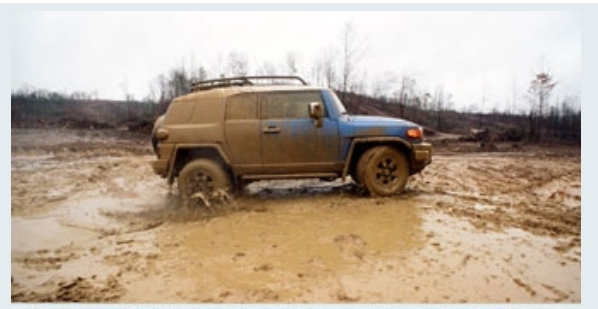
FJ Cruiser shown in Sun Fusion with accessory rock rails