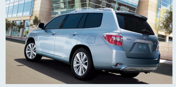
Highlander Hybrid shown in Wave Line Pearl with available Extra Value Package #2 and accessory roof rail cross bars

Limited shown in Ash leather trim with available Extra Value Package #2