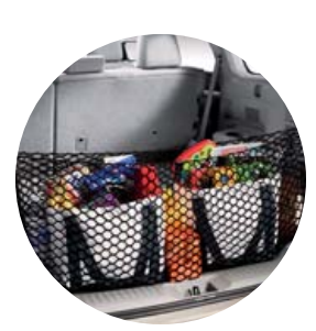
Cargo net — envelope39