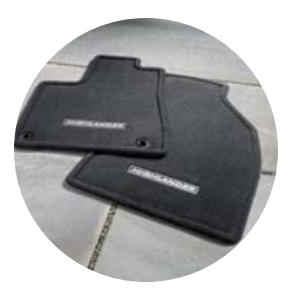
Carpet floor mats42