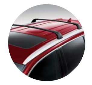
Roof rail cross bars (XLE, Limited)