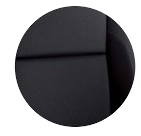
Limited and Hybrid Limited perforated leather shown in Black