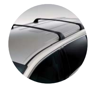
Roof rail cross bars (LE, LE Plus)