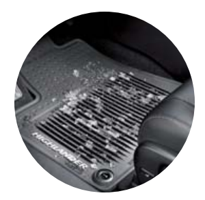
All-weather floor mats<sup>42</sup>

Running boards<sup>46</sup> Tow hitch receiver<sup>40</sup> Towing wiring harness<sup>40</sup> Trailer ball and ball mount<sup>40</sup>