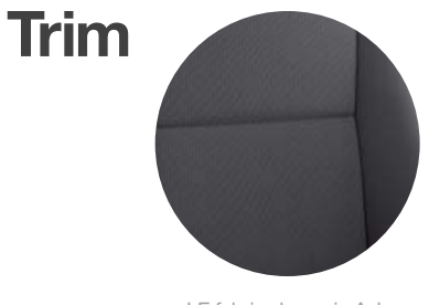
LE fabric shown in Ash