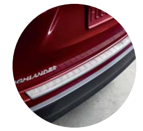
Rear bumper protector