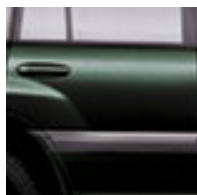
Imperial Jade Mica with Ivory or Shadow Gray Interior