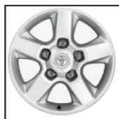
Available 5-spoke aluminum alloy wheel