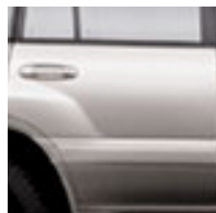
Champagne Pearl with Ivory or Shadow Gray Interior