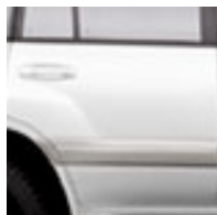
Natural White with Ivory or Shadow Gray Interior