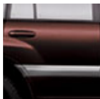
Mahogany Pearl with Ivory Interior