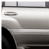
Thunder Cloud Metallic with Shadow Gray Interior