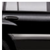
Black with Ivory or Shadow Gray Interior