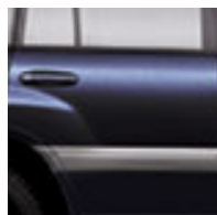
Atlantis Blue Mica with Ivory or Shadow Gray Interior