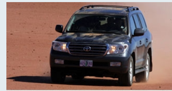
Land Cruiser shown in Magnetic Gray Metallic with available Upgrade Package