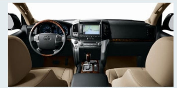
Prototype vehicle shown with optional equipment. Production model may vary