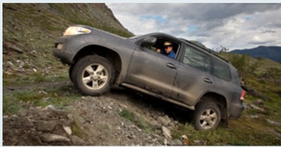
Land Cruiser shown in Magnetic Gray Metallic with available Upgrade Package