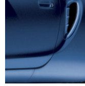
Spectra Blue Mica with Black fabric or Black leather interior