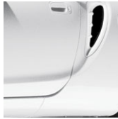
Super White with Black fabric or Tan leather interior