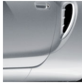
Silver Streak Mica with Gray or Black fabric or Black leather interior