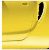
Solar Yellow with Black fabric or Black leather interior