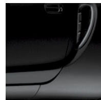
Black with Black or Red cloth or Tan leather interior

*See Specifications page for more information on Toyota's Supplemental Restraint System (SRS).