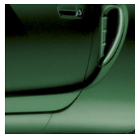
Electric Green Mica with Tan leather interior