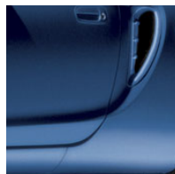
Spectra Blue Mica with Black cloth interior