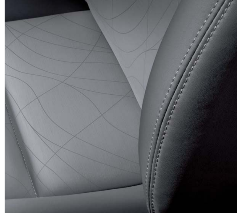
1. See footnote 11 in Disclosures section.

weighs approximately half as much as genuine leather, and its manufacturing process generates about 99% fewer Volatile Organic Compounds (VOCs) than that of conventional synthetic leather.