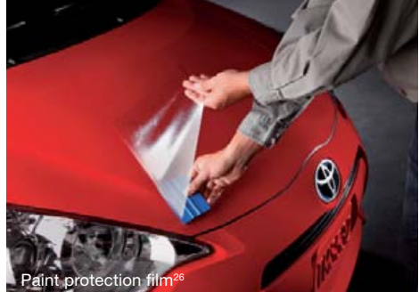
See numbered footnotes in Disclosures section.