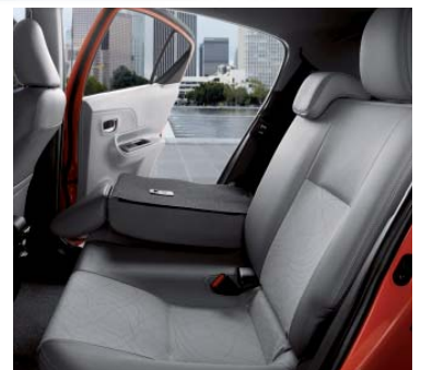
1. Cargo and load capacity limited by weight and distribution.

You could say that Prius c is loaded with capability. The available 60/40 split fold-down rear seats are engineered to offer a wide variety of custom seating and cargo configurations