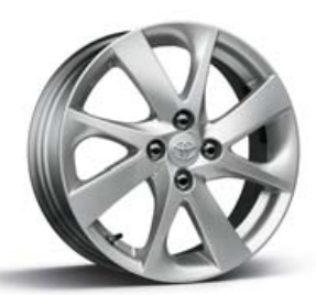
16-in. 8-spoke alloy wheels