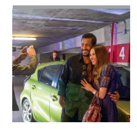
Four friends, great music, and lots of creativity – that's all we need. Let's make the next big thing.