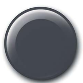
Magnetic Gray Metallic