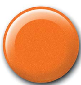
Tangerine Splash Pearl<sup>1</sup>