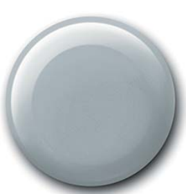
Classic Silver Metallic