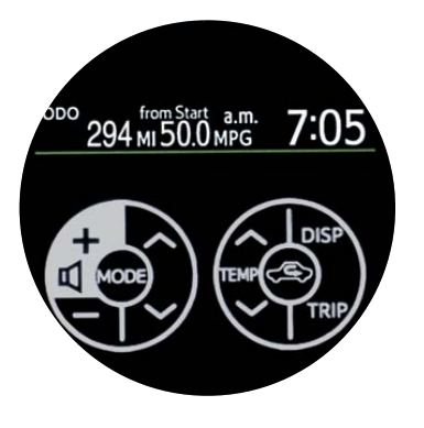
TOUCH TRACER DISPLAY

Let's not miss a thing. Prius c makes it easy to stay connected to your friends, your tunes and your passions with available Entune<sup>TM</sup> Premium Audio with Navigation.<sup>1</sup> Featuring the powerful Entune<sup>®</sup> App Suite,<sup>2</sup> this system lets you stream music with Pandora,<sup>93</sup> buy movie tickets with MovieTickets.com, make dinner reservations with OpenTable<sup>®</sup> and more – all from the comfort of your Prius c . Standard Bluetooth <sup>94</sup> wireless technology seamlessly connects your phone and favorite playlists, so you never have to miss a call, or your favorite driving mix<sup>5</sup>. It's just one more way Prius c helps fuel your passions 24/7.