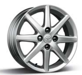
15-in. 8-spoke alloy wheels