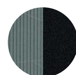
Prius c TWO and THREE Light Blue Gray/Black two-tone fabric