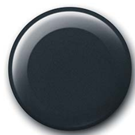
Black Sand Pearl