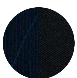
Prius c TWO and THREE Dark Blue/Black two-tone fabric