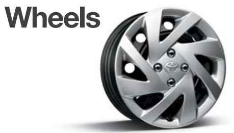
15-in. steel wheels with wheel cover