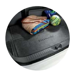
Carpet cargo mat