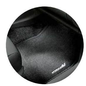
Carpet floor mats36