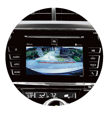
STANDARD BACKUP CAMERA<sup>2</sup>

Spend a minute behind the wheel and you'll soon feel right at home. Prius v 's advanced steering wheel is ready for many eco-sensitive miles of driving and features integrated controls for your entertainment, Bluetooth <sup>®1</sup> connectivity and more. And with its easy-to-read information displays and intuitive, high-tech controls, Prius v opens up a world of possibilities.