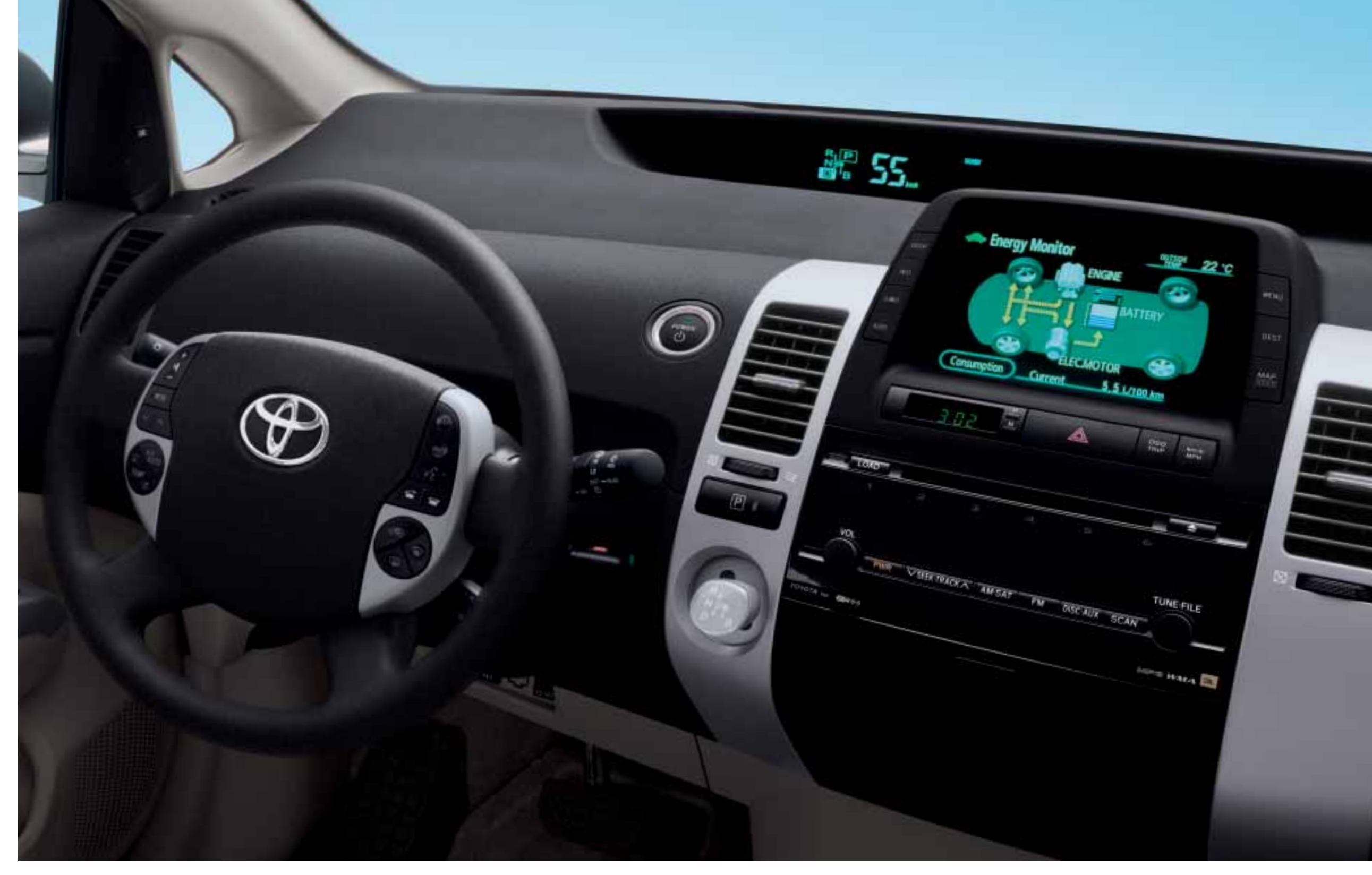
Above and right: Prius dash and detail images shown with optional equipment.

The Prius experience goes well beyond first impressions. Something you'll discover when you settle in behind the wheel and encounter a jaw-dropping array of amenities. Like an amazingly sensible push-button starter. Or steering wheelmounted controls and available Smart Entry & Start, which lets you magically unlock and start your car without even using the key. You can even take in the wonders of Hybrid Synergy Drive™ on an in-dash display screen. And as if Prius isn't already the most technically advanced car in its class, there's an available DVD-based navigation system<sup>1</sup> with back-up camera, a JBL premium AM/FM and a 6-disc CD autochanger with 9-speakers for a sound you - and your ears - simply will not believe. Prius. Another word for "tomorrow."