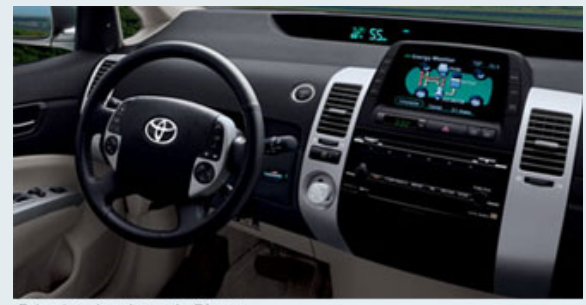
Prius shown in Magnetic Gray Metallic