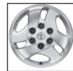
Limited Standard split 3-spoke aluminum alloy wheel