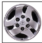
SR5 available 5-spoke aluminum alloy wheel