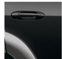
Black with Charcoal or Oak interior SR5 with Thunder Gray trim