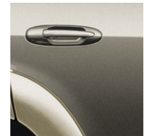
Thunder Gray Metallic with Charcoal or Oak interior SR5 with Warm Silver Trim