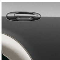
Phantom Gray Pearl with Charcoal or Oak interior SR5 with Warm Silver trim