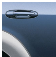
Blue Marlin Pearl 1 with Charcoal or Oak interior SR5 with Silver Sky trim