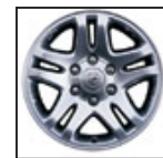
SR5 available Limited standard 17" split 5- spoke aluminum alloy wheel