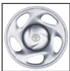
SR5 standard 16" styled steel wheel