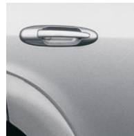
Silver Sky Metallic with Charcoal interior SR5 with Silver Sky trim