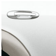
Natural White with Charcoal or Oak interior SR5 with Warm Silver trim