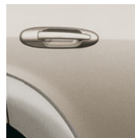
Desert Sand Mica 1 with Oak interior SR5 with Warm Silver trim