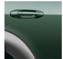
Imperial Jade Mica with Charcoal or Oak interior SR5 with Phantom Gray trim