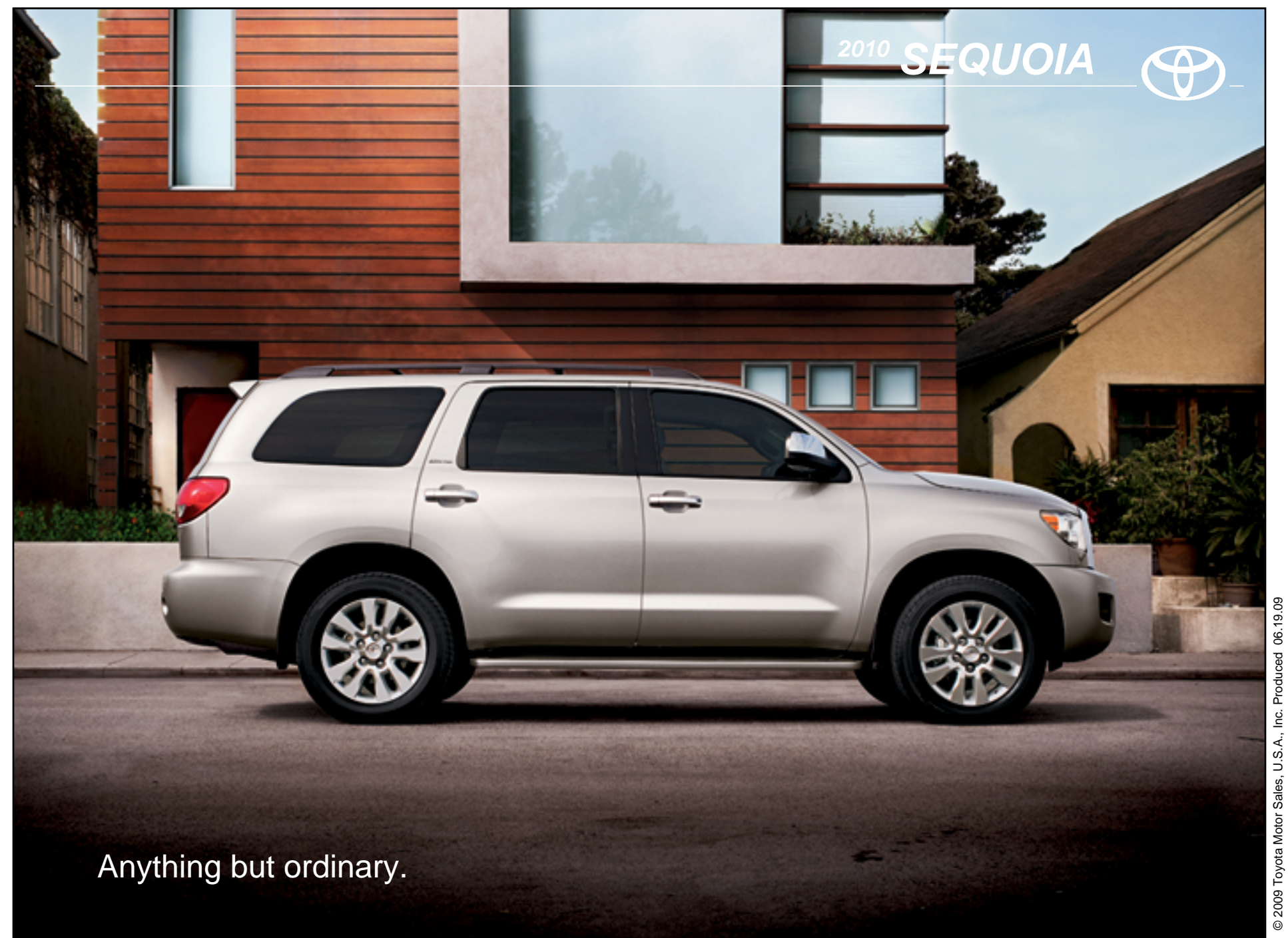
PAGE 1 of 15