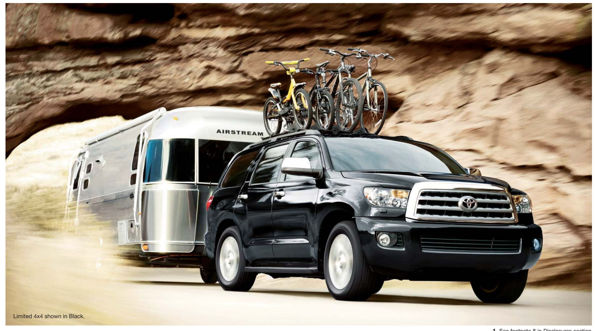
1. See footnote 8 in Disclosures section.

When you take your family into the sticks, you need a vehicle that's strong and reliable. Precisely what you get with Sequoia. It's forged on a fully boxed frame for strength and durability. It also boasts an available 381-hp 5.7L V8 with up to 7400 lb. of towing capacity. Plus, a TOW/HAUL Mode that selects transmission shift points to optimize that power. So grab the gang and the gear. Where you're going, you won't need to fight for a space to put the picnic blanket.