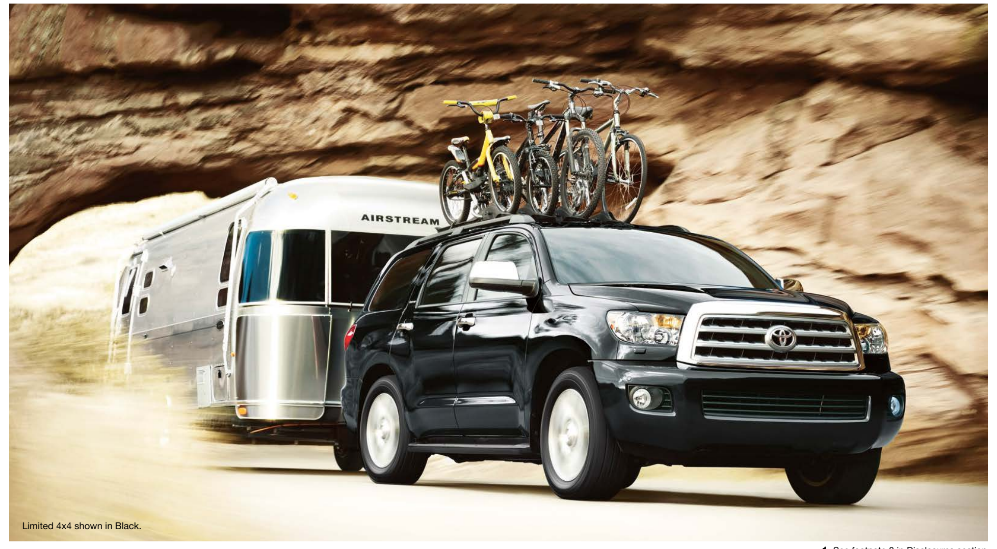
1. See footnote 8 in Disclosures section.

When you take your family into the sticks, you need a vehicle that's strong and reliable. Precisely what you get with Sequoia. It's forged on a fully boxed frame for strength and durability. It also boasts an available 381-hp 5.7L V8 with up to 7400 lb. of towing capacity! Plus, a TOW/HAUL Mode that selects transmission shift points to optimize that power. So grab the gang and the gear. Where you're going, you won't need to fight for a space to put the picnic blanket.