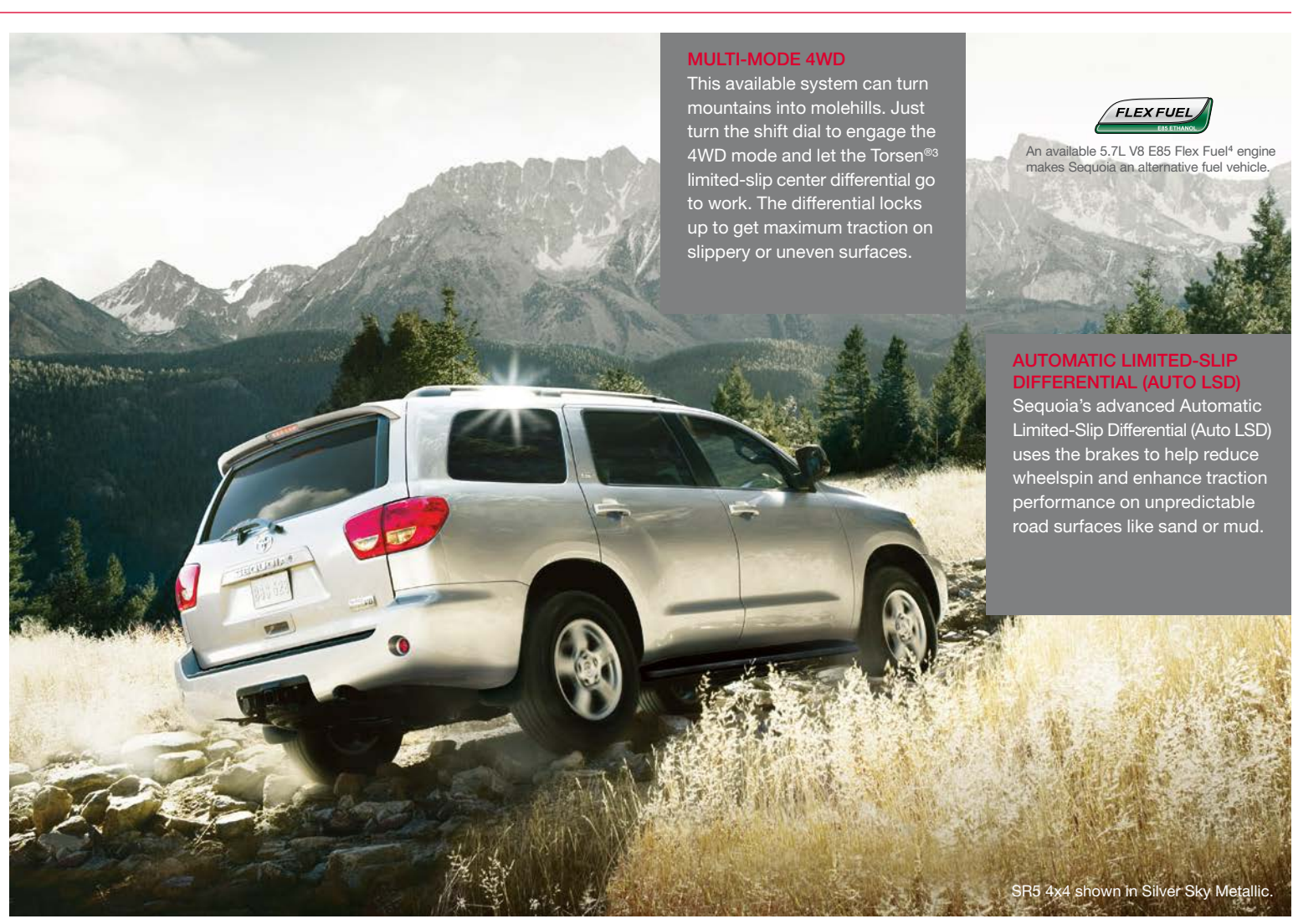
1. See footnote 31 in Disclosures section. 2. See footnote 32 in Disclosures section. 3. See footnote 5 in Disclosures section. 4. See footnote 4 in Disclosures section.

When towing, winds or load undulation can cause trailer sway. TSC is designed to apply brake pressure at individual wheels and manage engine torque to help the driver maintain control of the trailer.