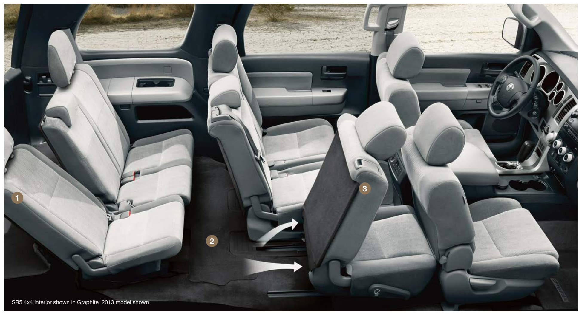
1. Standard on SR5 and Limited. Not available on Platinum.

With spacious seating for eight,<sup>1</sup> Sequoia has room for the whole family and then some. And what could be better? After all, adventures are best shared.