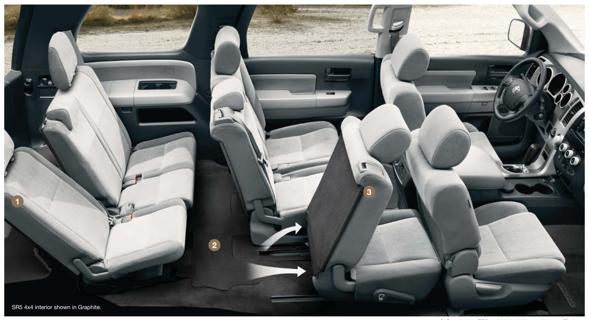
1. Standard on SR5 and Limited. Not available on Platinum.

With spacious seating for eight,<sup>1</sup> Sequoia has room for the whole family and then some. And what could be better? After all, adventures are best shared.