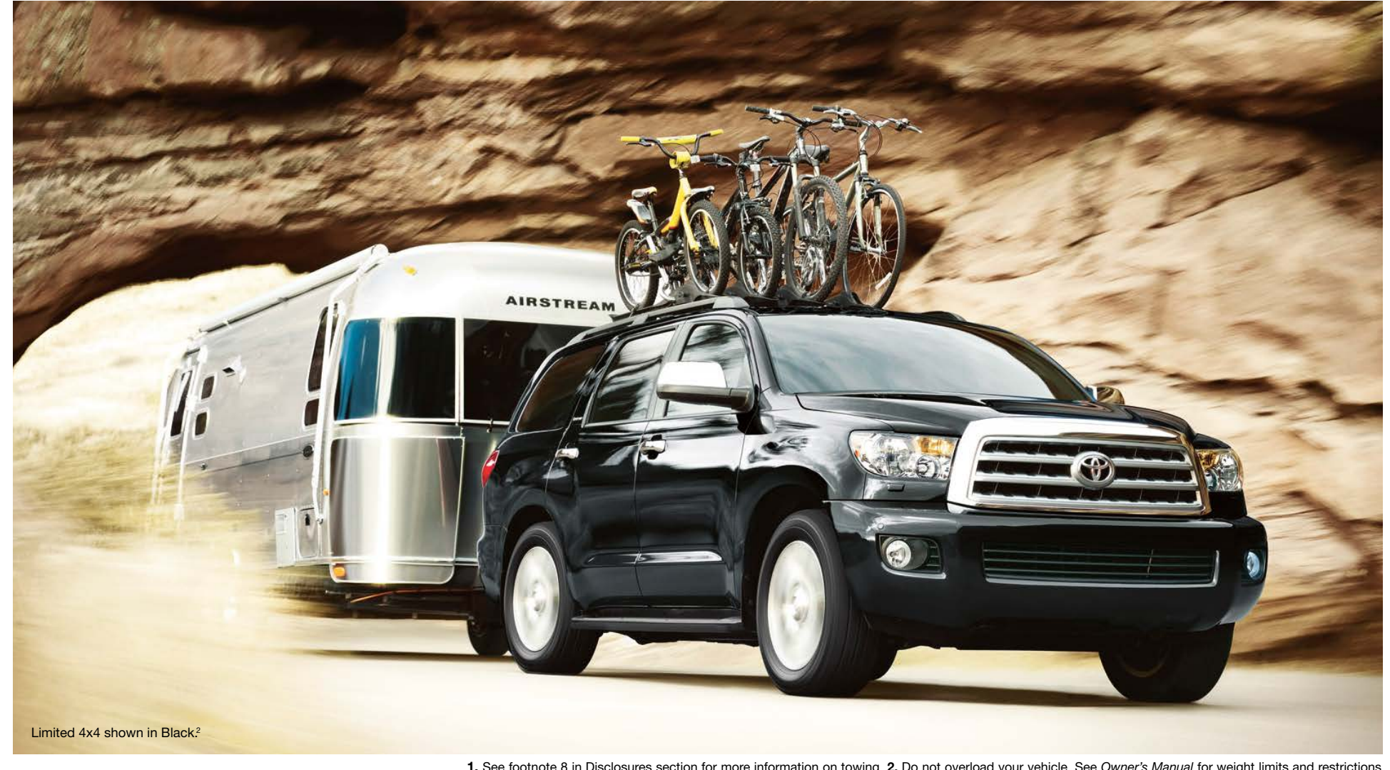
1. See footnote 8 in Disclosures section for more information on towing. 2. Do not overload your vehicle. See Owner's Manual for weight limits and restrictions.

When you take your family into the sticks, you need a vehicle that's strong and reliable. Precisely what you get with Sequoia. It's forged on a fully boxed frame for strength and durability. It also boasts an available 381-hp 5.7L V8 with up to 7400 lb. of towing capacity. Plus, a TOW/HAUL Mode that selects transmission shift points to optimize that power. So grab the gang and the gear. Where you're going, you won't need to fight for a space to put the picnic blanket.