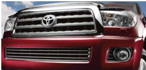
Front skid plate