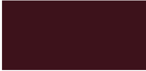
Sizzling Crimson Mica