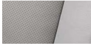
Platinum perforated leather trim shown in Graphite