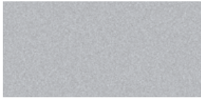
Silver Sky Metallic