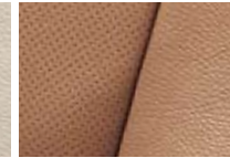
Red Rock 42