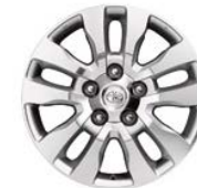
Platinum standard 20-in. diamond-cut-finish alloy wheel