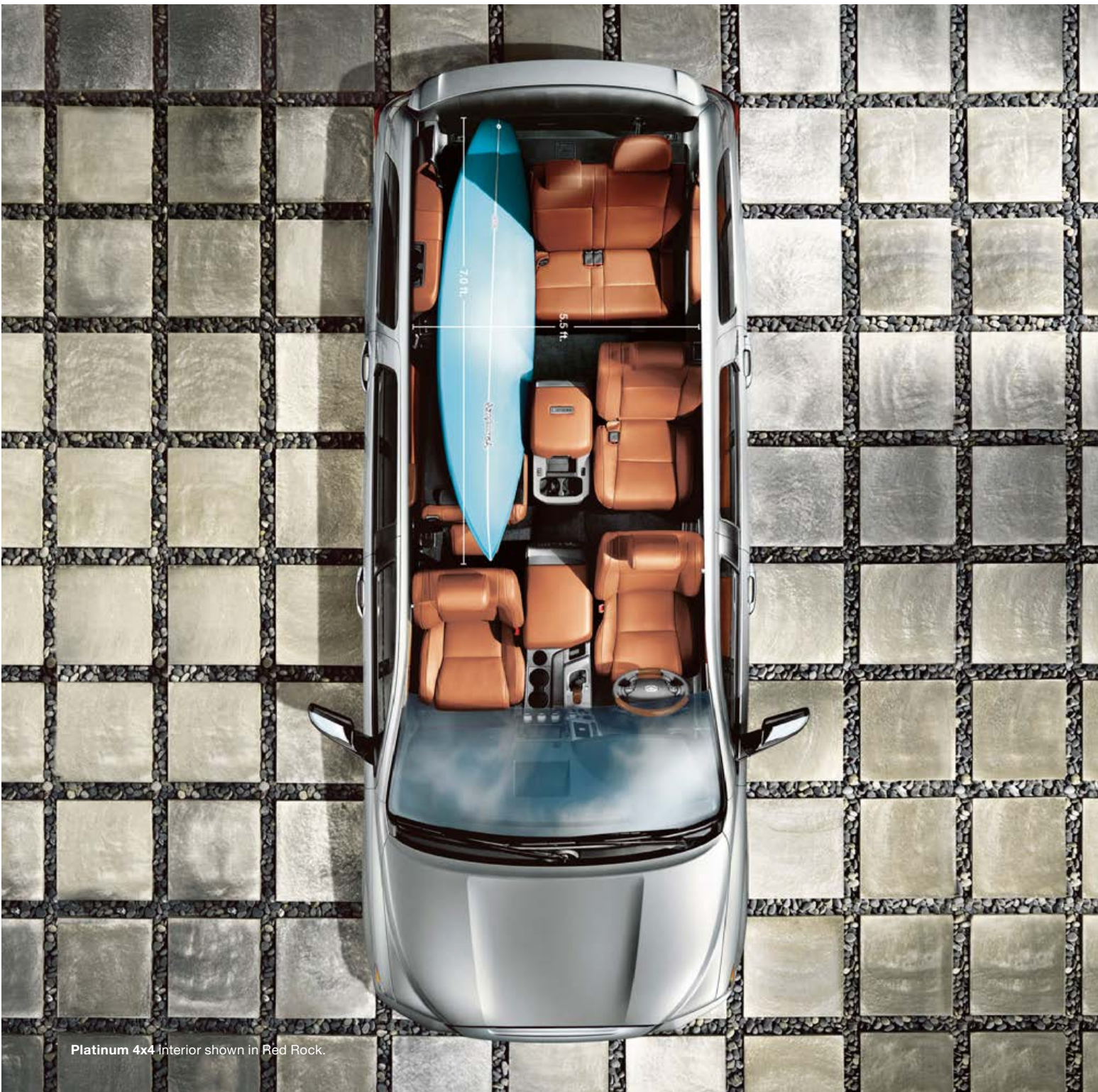
Platinum 4x4 Interior shown in Red Rock.