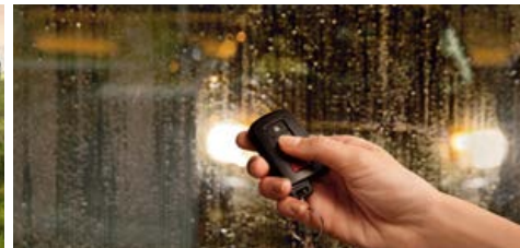
Remote Engine Starter