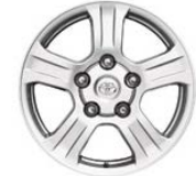
SR5 standard 18-in. alloy wheel