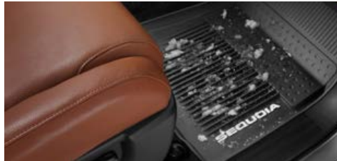
All-weather floor liners 43