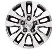
Limited standard 20-in. alloy wheel