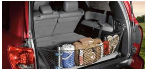
Cargo net — envelope 4