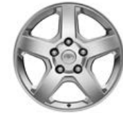
SR5 available 20-in. Sport alloy wheel