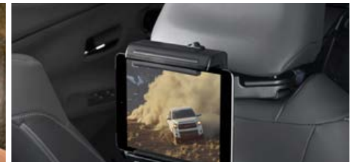
Universal tablet holder (tablet device not included)