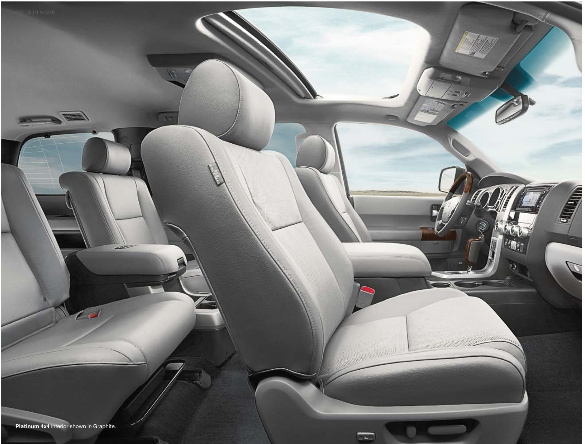
Platinum 4x4 interior shown in Graphite.