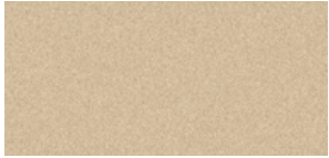
Sandy Beach Metallic