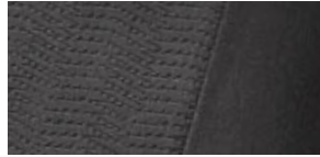
SR5 easy-clean fabric shown in Black 39