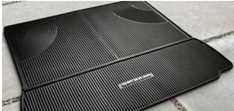
All-weather cargo liner 4

Paint protection film 44 — hood & fender Remote Engine Starter Trailer ball and ball mount Universal tablet holder