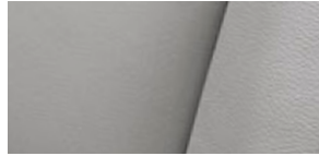
Limited leather trim shown in Graphite