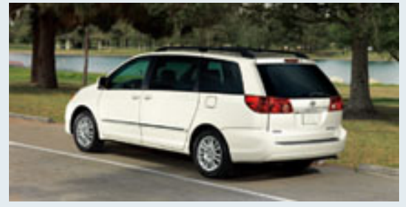
Limited shown in Stone leather trim with available DVD navigation system [4]