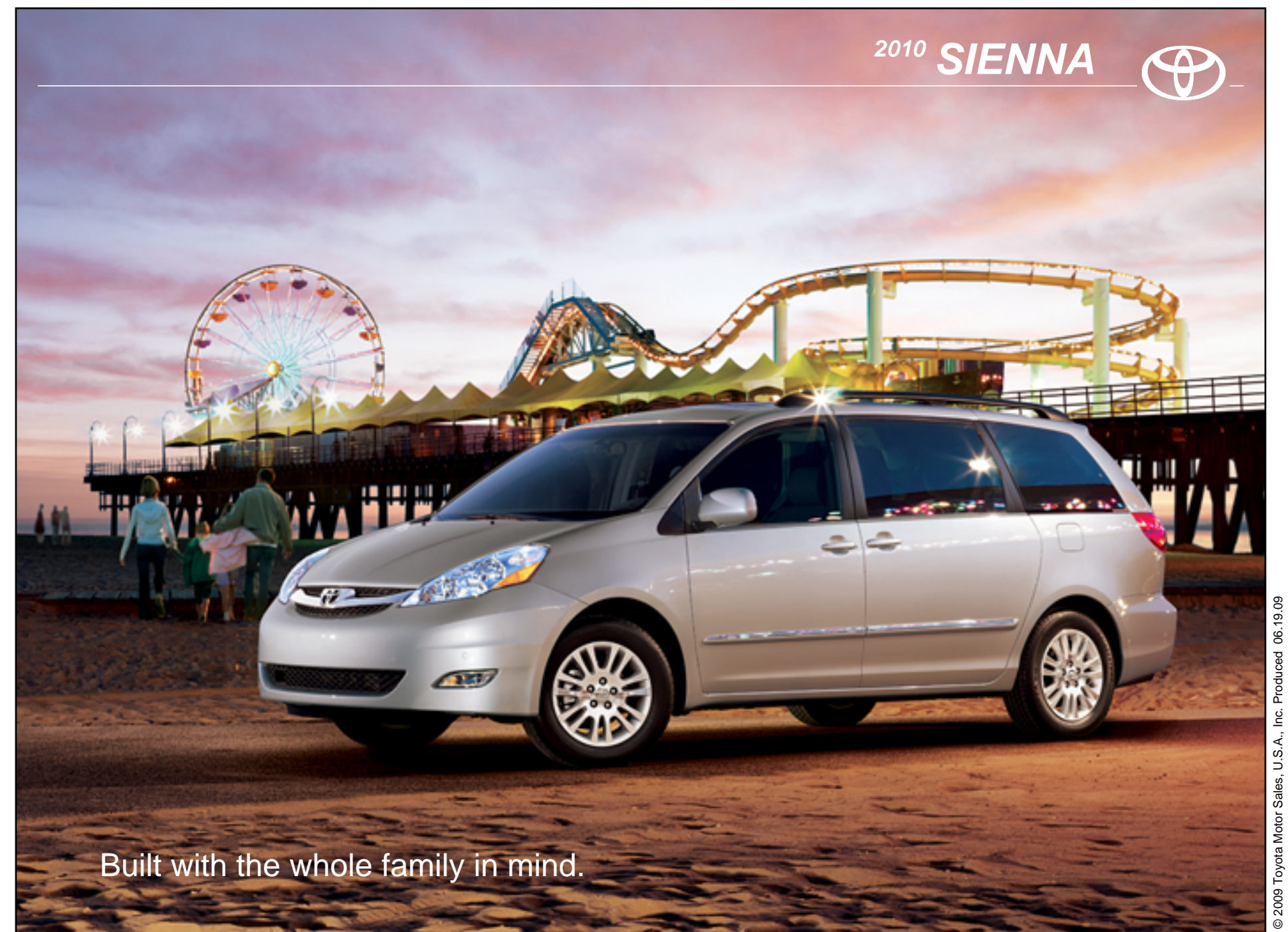
PAGE 1 of 18