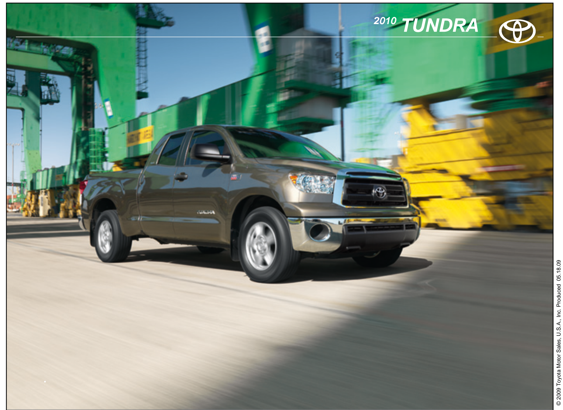
PAGE 1 of 15