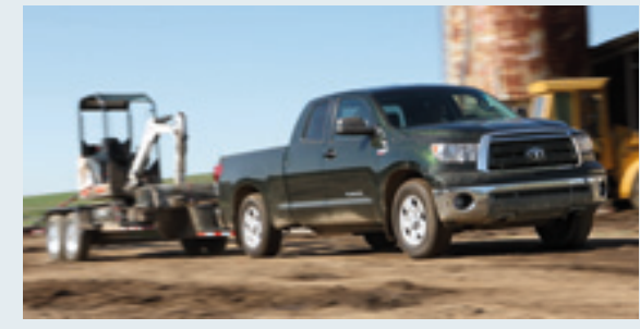
4x4 Crewmax Tundra shown in Sandy Beach Metallic with available 4.6L V8, fog lamps and 18-inch alloy wheels.