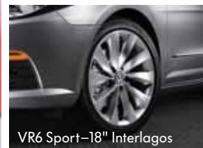
VR6 Sport-18" Interlagos