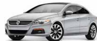
Reflex Silver Metallic