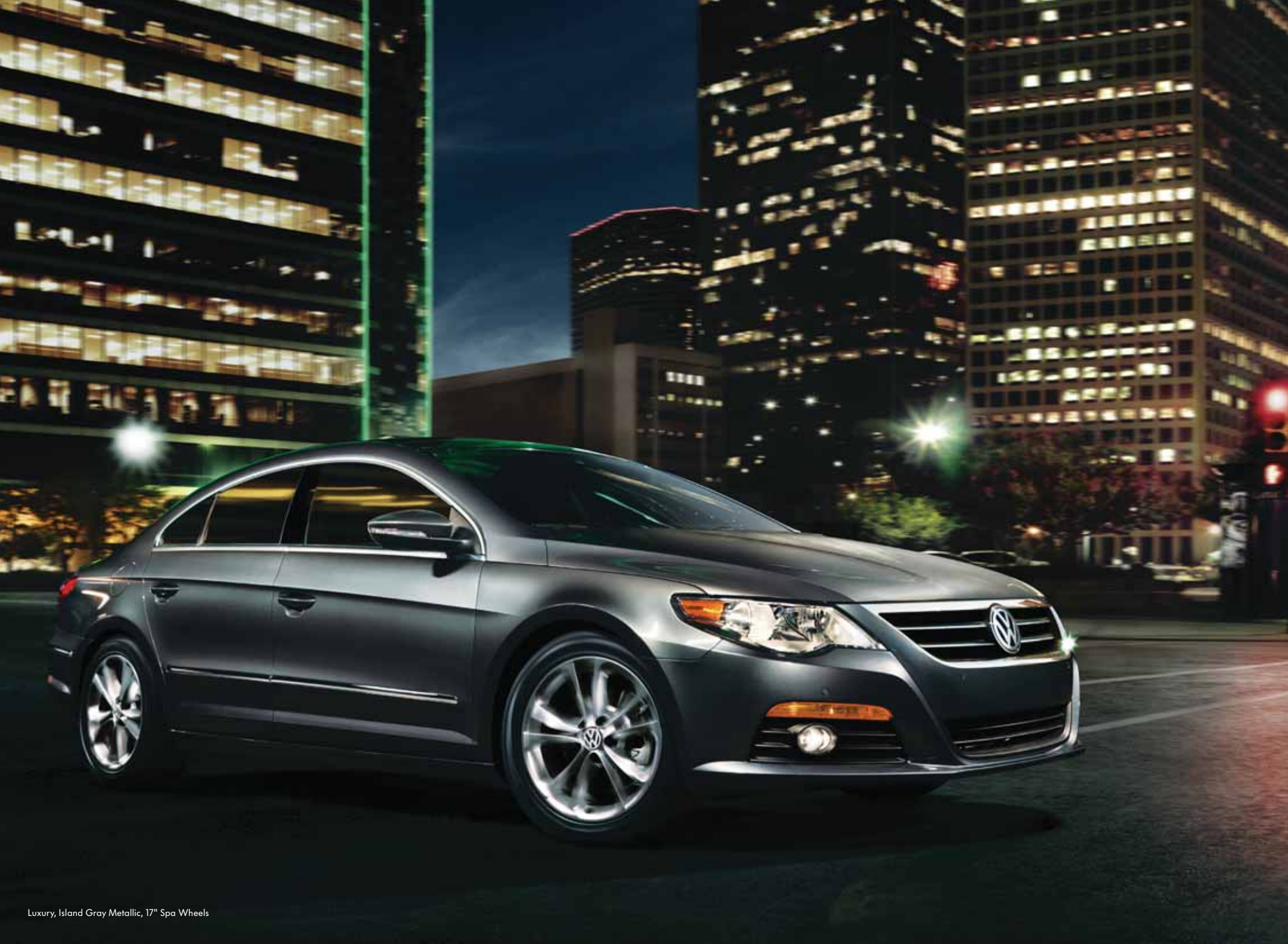
Luxury, Island Gray Metallic, 17" Spa Wheels