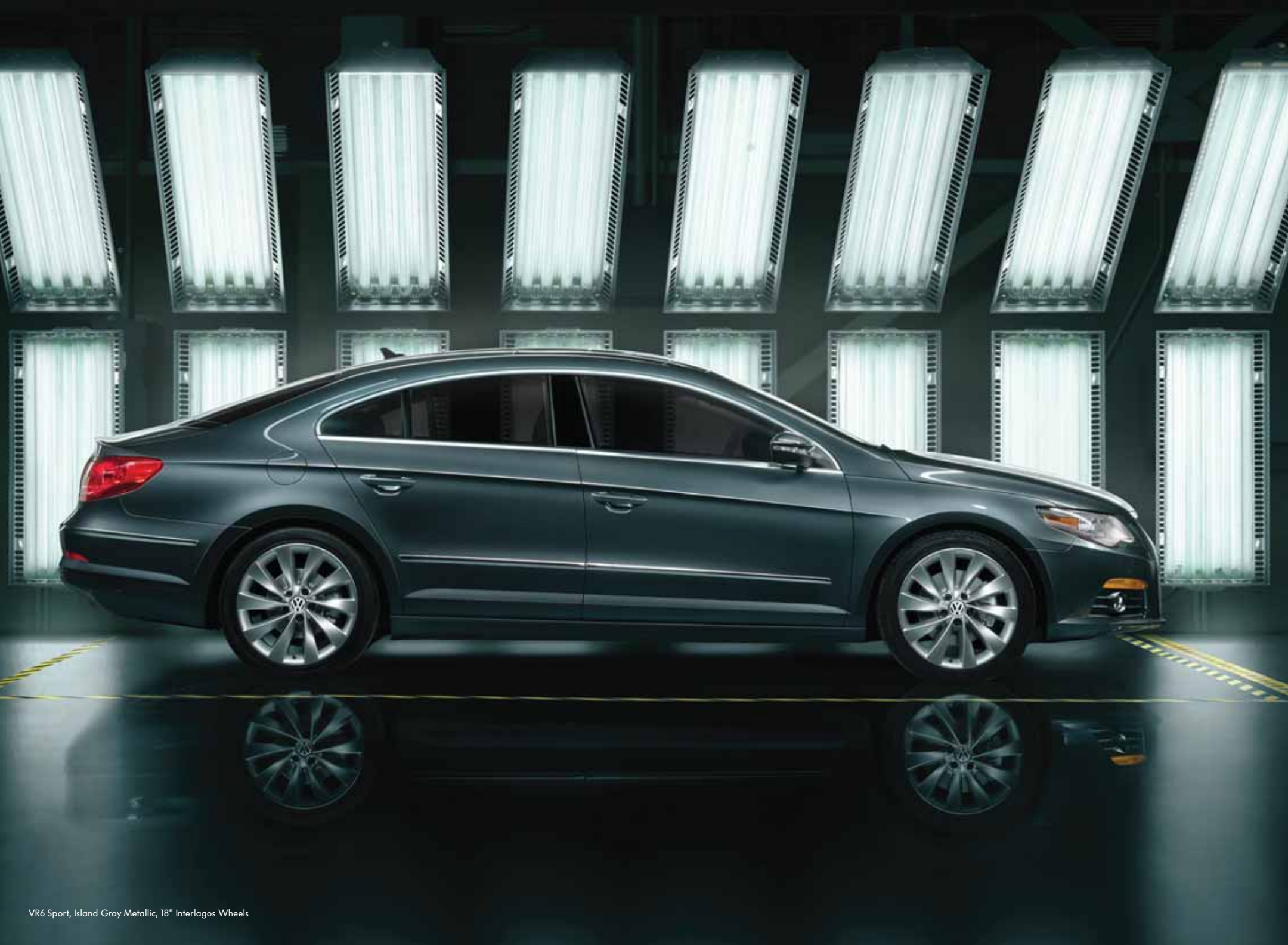
VR6 Sport, Island Gray Metallic, 18" Interlagos Wheels