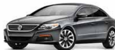
Island Gray Metallic