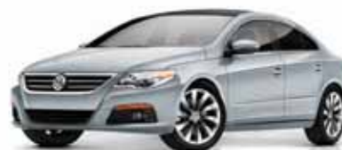
Iron Gray Metallic