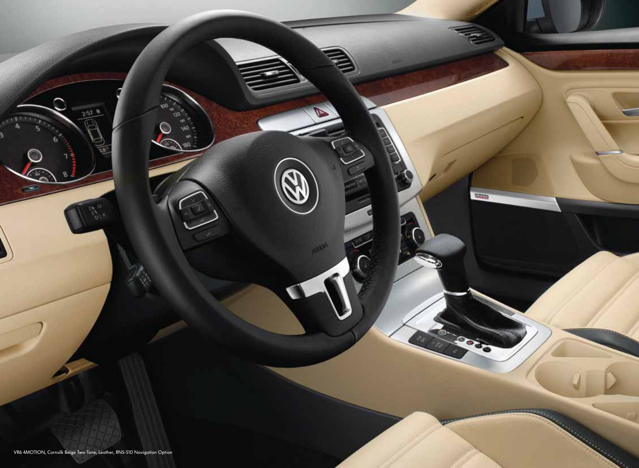
VR6 4MOTION, Cornsilk Beige Two-Tone, Leather, RNS-510 Navigation Option