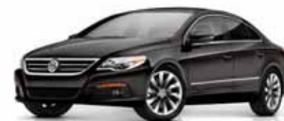
Mocha Anthracite Metallic