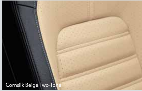
Cornsilk Beige Two-Tone