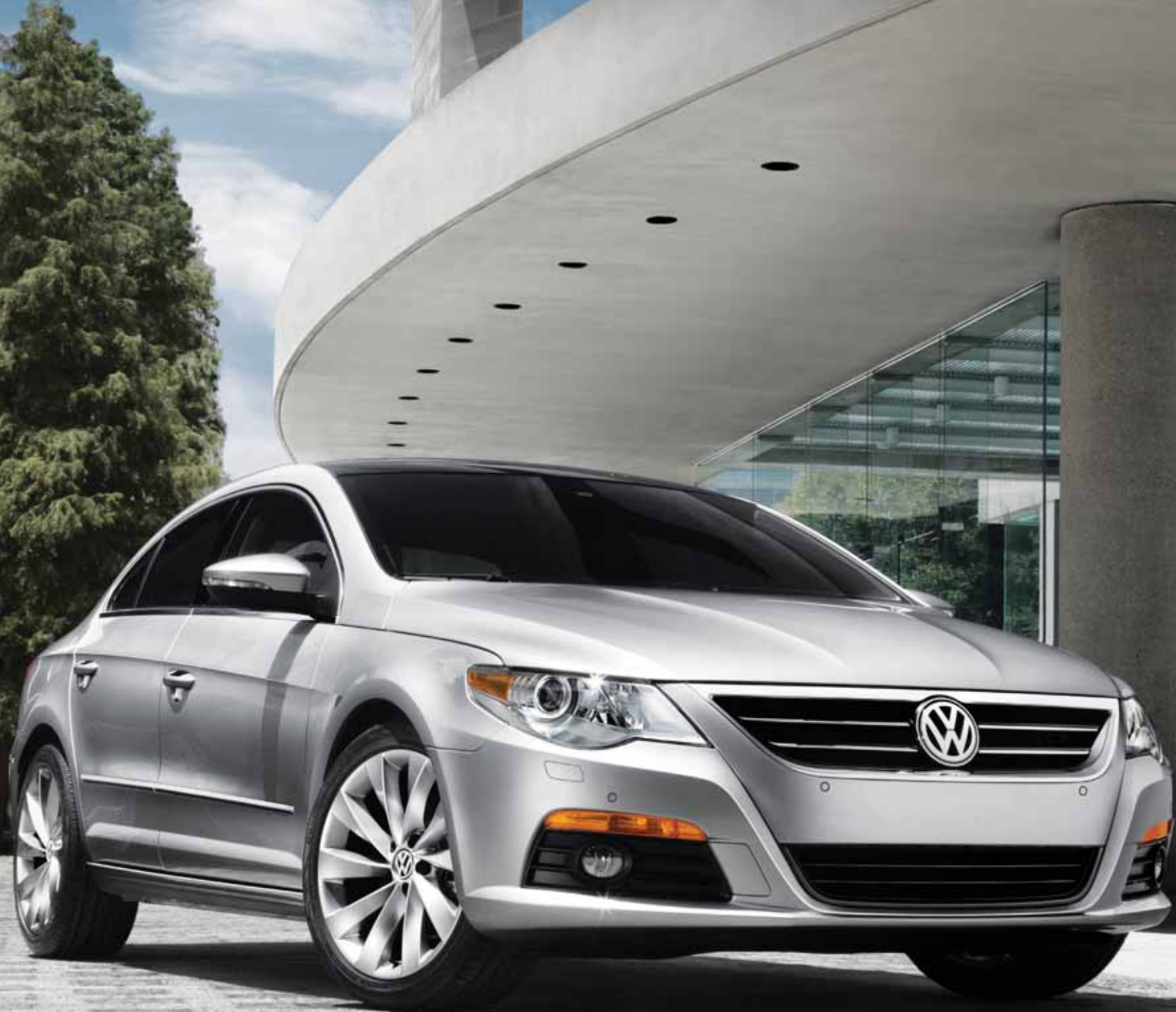
VR6 Sport, Reflex Silver Metallic, 18" Interlagos Wheels