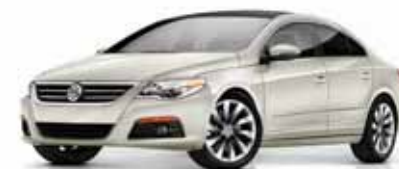
White Gold Metallic