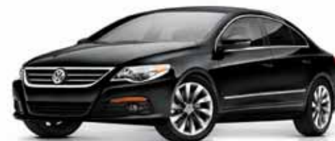
Deep Black Metallic