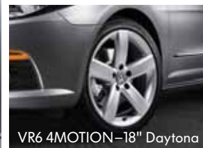
VR6 4MOTION-18" Daytona