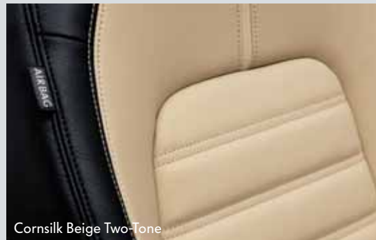
Cornsilk Beige Two-Tone