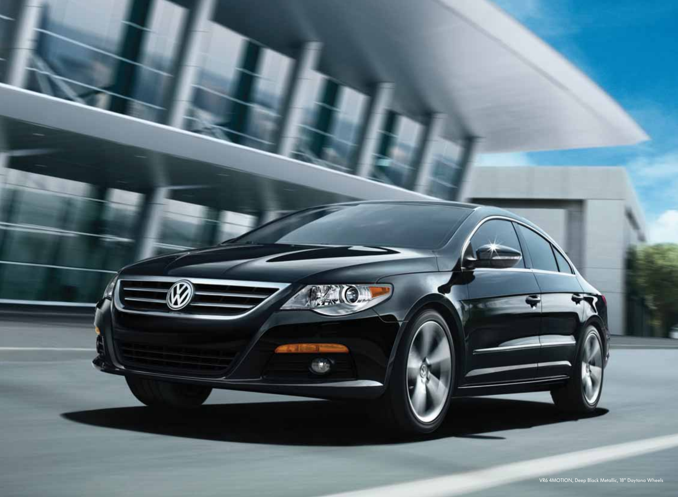
VR6 4MOTION, Deep Black Metallic, 18" Daytona Wheels