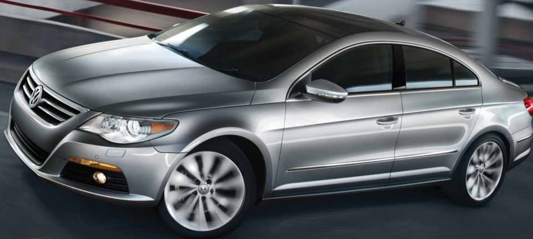
VR6 Sport, Reflex Silver Metallic, 18" Interlagos Wheels