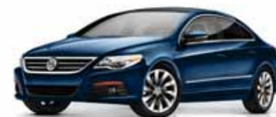
Shadow Blue Metallic