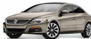
Light Brown Metallic