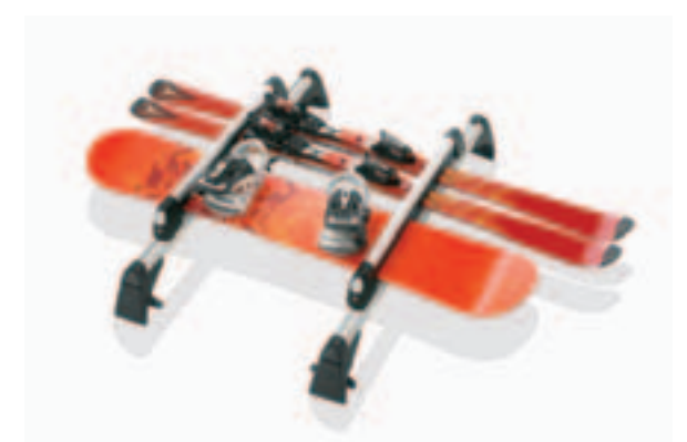
Base Carrier Bars with Ski/Snowboard Attachment