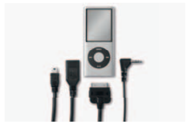
Variety of MDI Cables for Digital Playback Devices (iPod is not included)