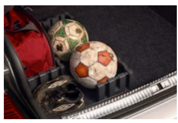
Heavy Duty Trunk Liner with CarGo™ Organizer Blocks