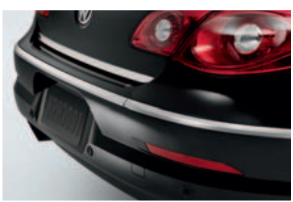
Rear Chrome Accent