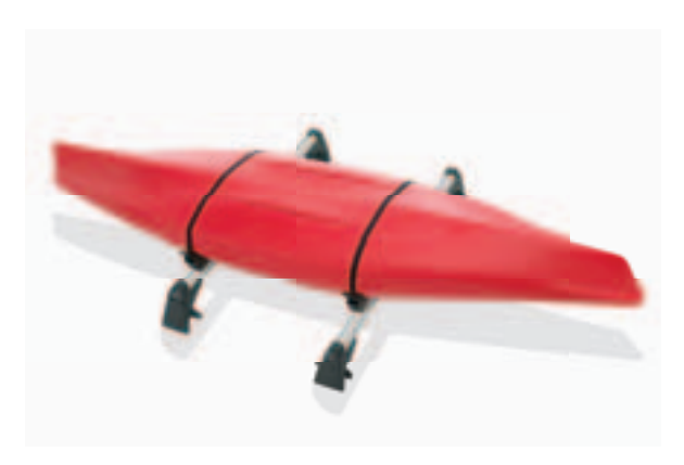
Base Carrier Bars with Kayak Holder