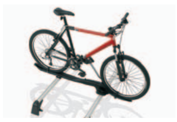
Base Carrier Bars with Bike Holder Attachment

"iPod" is a registered trademark of Apple, Inc. All rights reserved.