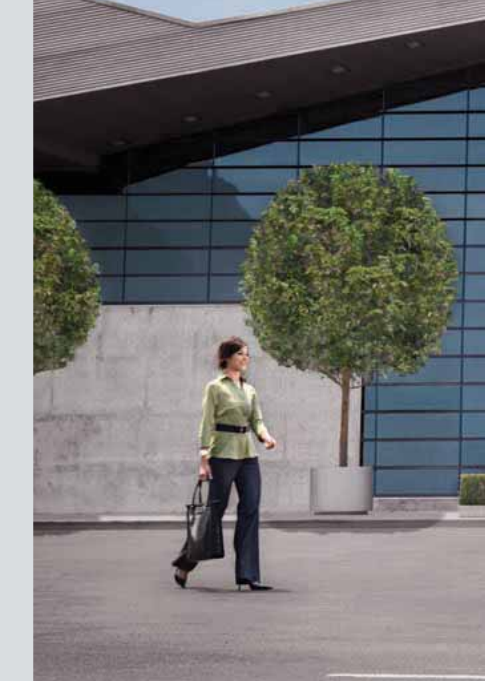
Reflex Silver Metallic