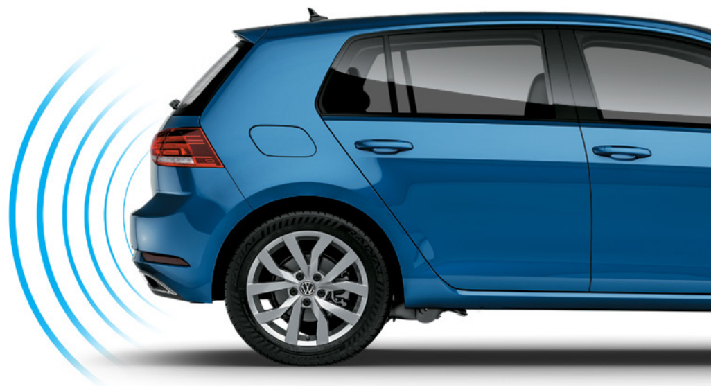
Rear Traffic Alert*

When driving, if you attempt to change lanes, the Blind Spot Monitor can help alert you to cars that may be in your blind spot. The Active Blind Spot Monitor (available when vehicle is equipped with Lane Assist) on select models can also counter-steer within the limits of Lane Assist to help keep you in your lane if you attempt to change lanes when a vehicle is in your blind spot.