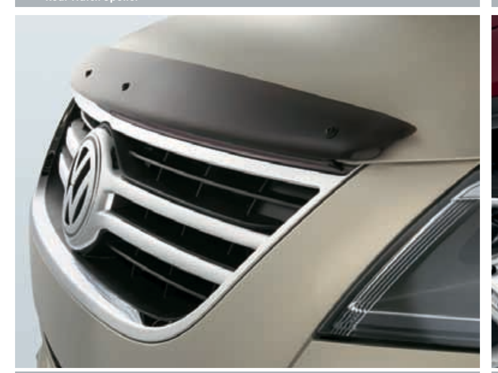
Rear Hatch Spoiler

Base Carrier Bars with Snowboard/Ski Attachment