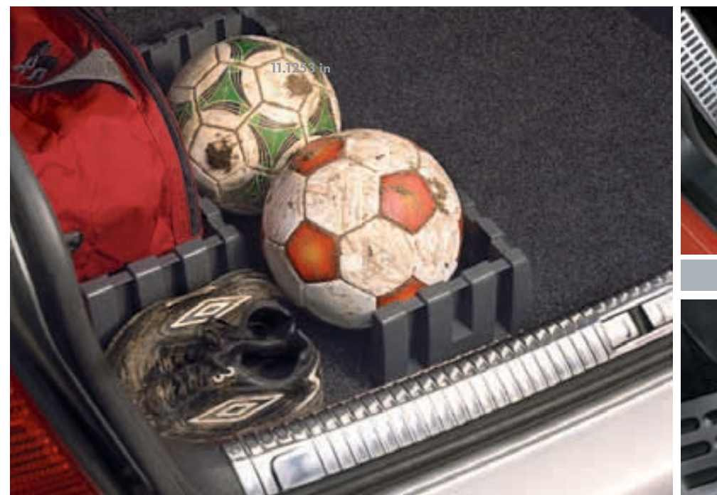
Heavy-Duty Trunk Liner with CarGo Bl