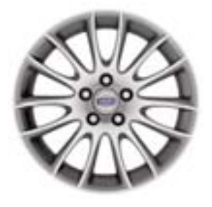
MIRZAM 18" (optional)