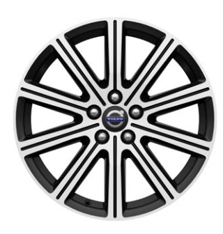
Titania, 20x8" Diamond Cut/Glossy Black (Standard T6 Inscription)