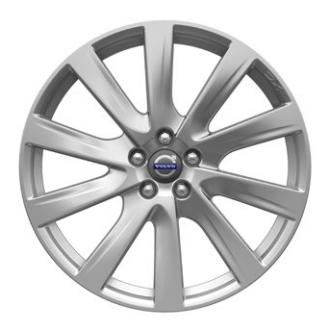
Avior, 20x8" Silver Bright (Optional Inscription)