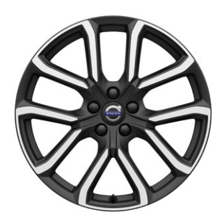
Lesath 19x7.5" Diamond Cut/Tech Matte Black (Standard T6 Dynamic)