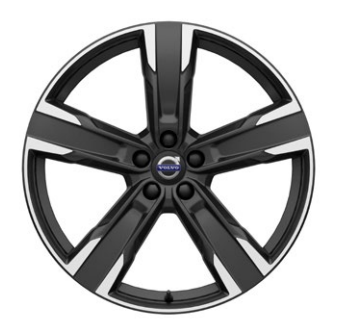
Altais, 20x8" Diamond Cut/Matt Tech Black (Optional Dynamic)