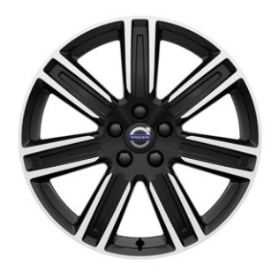
Leda 18x7.5" Diamond Cut/Glossy Black (Standard T5 Dynamic)