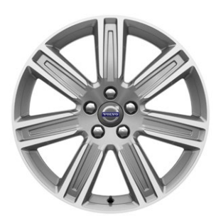
Leda 18x7.5" Diamond Cut/Light Light Grey (Standard T5 Inscription)