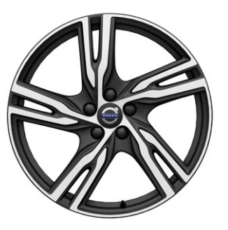
lxion, 20×8" Diamond Cut/Matt Black (Standard T6 R-Design)