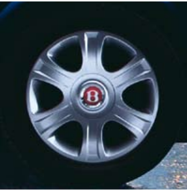
18"x8| 6-SPOKE CHROME PLATED ALUMINIUM ALLOY