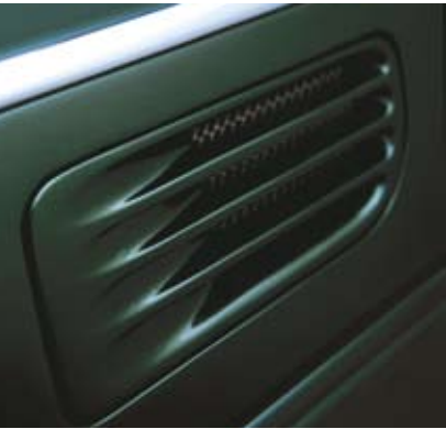
LOWER FRONT WING VENT

We believe there is always room for that personal touch. When it comes to exterior tailoring you have a wealth of additions available to you. Free your imagination.