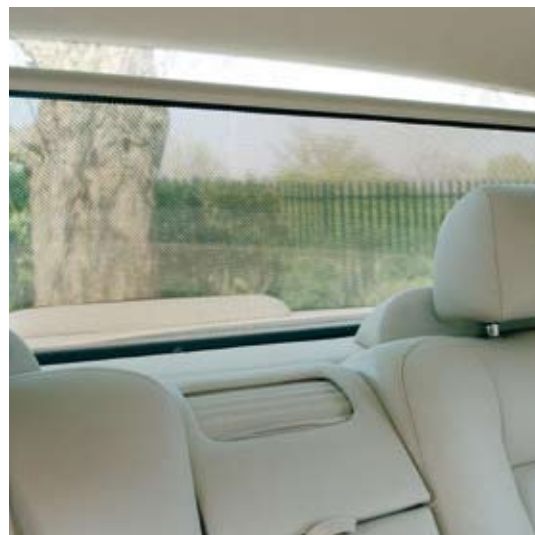
ELECTRIC BLIND TO REAR WINDOW