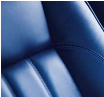
hide matched to customer colour specification