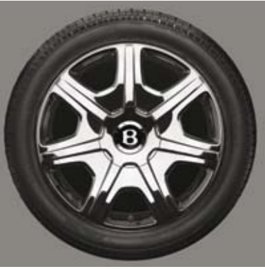
19"x8| 7-SPOKE CHROME PLATED ALUMINIUM ALLOY