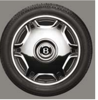
19"x8| 6 TWIN-SPOKE DISC ALUMINIUM ALLOY (CHROMED)