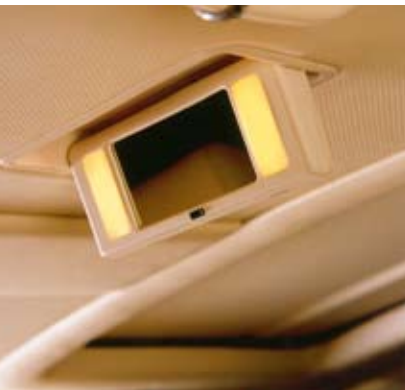
TWIN REAR FOLD DOWN ILLUMINATED VANITY MIRRORS