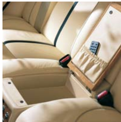
REAR SEAT CENTRE CUSHION STOWAGE BOX WITH VENEERED LID