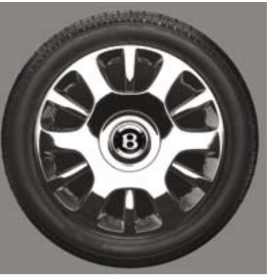
19"x8| 12-SPOKE CHROME PLATED ALUMINIUM ALLOY