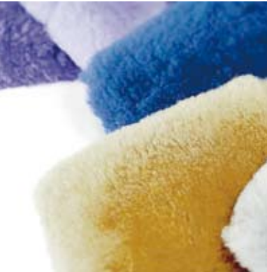
lambswool rugs matched to customer colour specification*