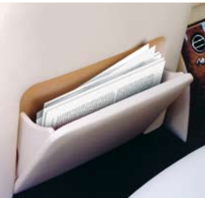
DOCUMENT STOWAGE TO LOWER FRONT SEAT BACK - HIDE