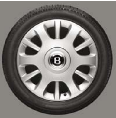
19"x8| 12-SPOKE ALUMINIUM ALLOY