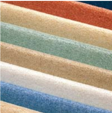
carpets matched to customer colour specification