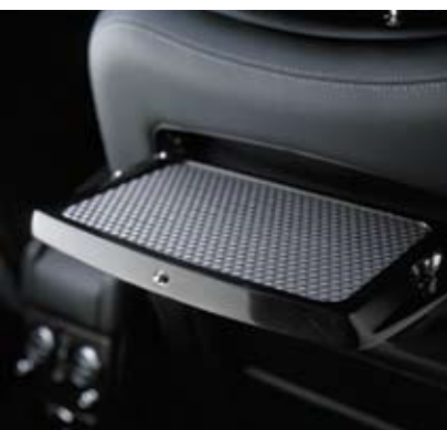
PIANO BLACK PICNIC TABLES WITH ENGINE-TURNED ALUMINIUM INSERTS

How do you intend to use your Bentley? Does it need to be capable of entertaining? Does it need to be a mobile office? Will it need additional facilities and luxuries? Whatever your necessities we will do everything to meet your requirements. We are here to listen. To bring your dreams to life.