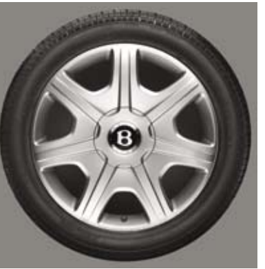
19"x8| 7-SPOKE ALUMINIUM ALLOY