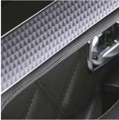
engine-turned aluminium inserts to waist rails