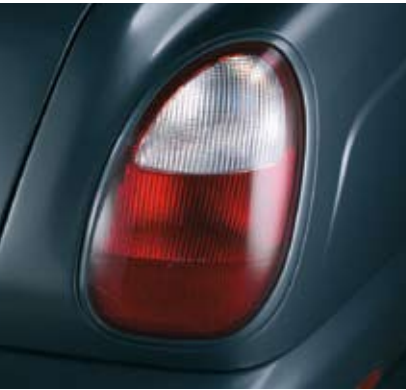
BODY COLOURED LAMP BEZELS