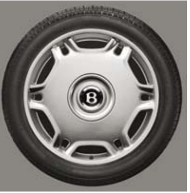
19"x8| 6 TWIN-SPOKE DISC ALUMINIUM ALLOY