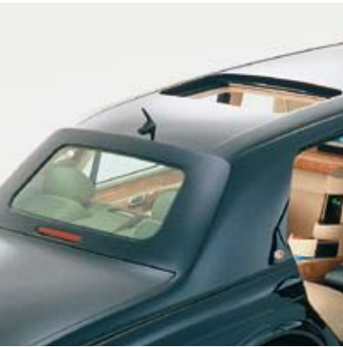
REAR COMPARTMENT ELECTRIC SUNROOF* (*RL ONLY)