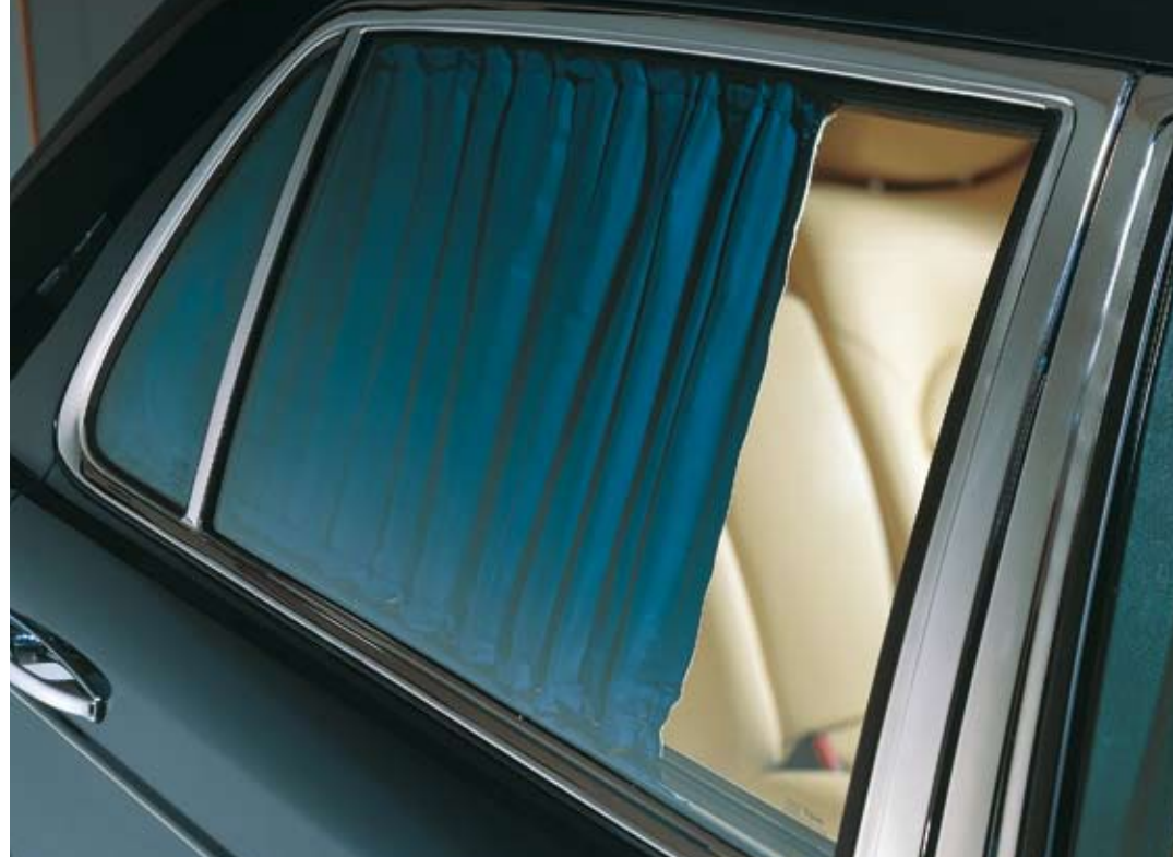
SILK CURTAINS TO REAR COMPARTMENT