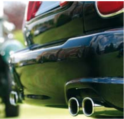
REAR SPORTS BUMPER AND QUAD EXHAUST TAILPIPES