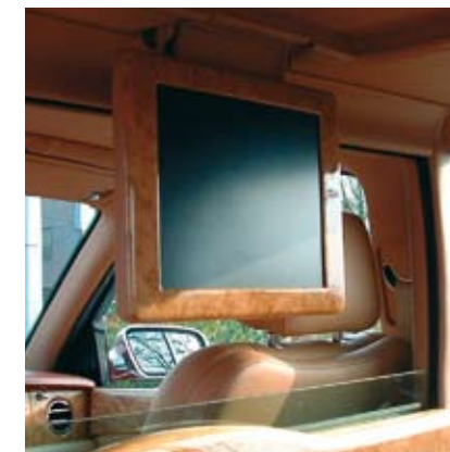
DVD & TV SYSTEM WITH POWER-FOLD LCD SCREEN*