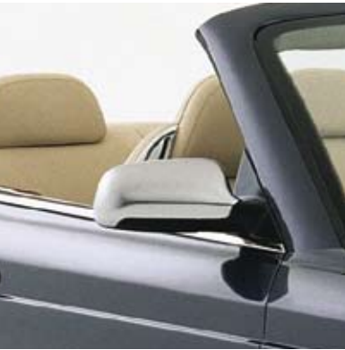
CHROME MIRROR CAPS