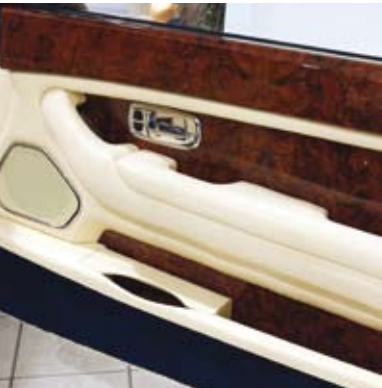
veneered door panels