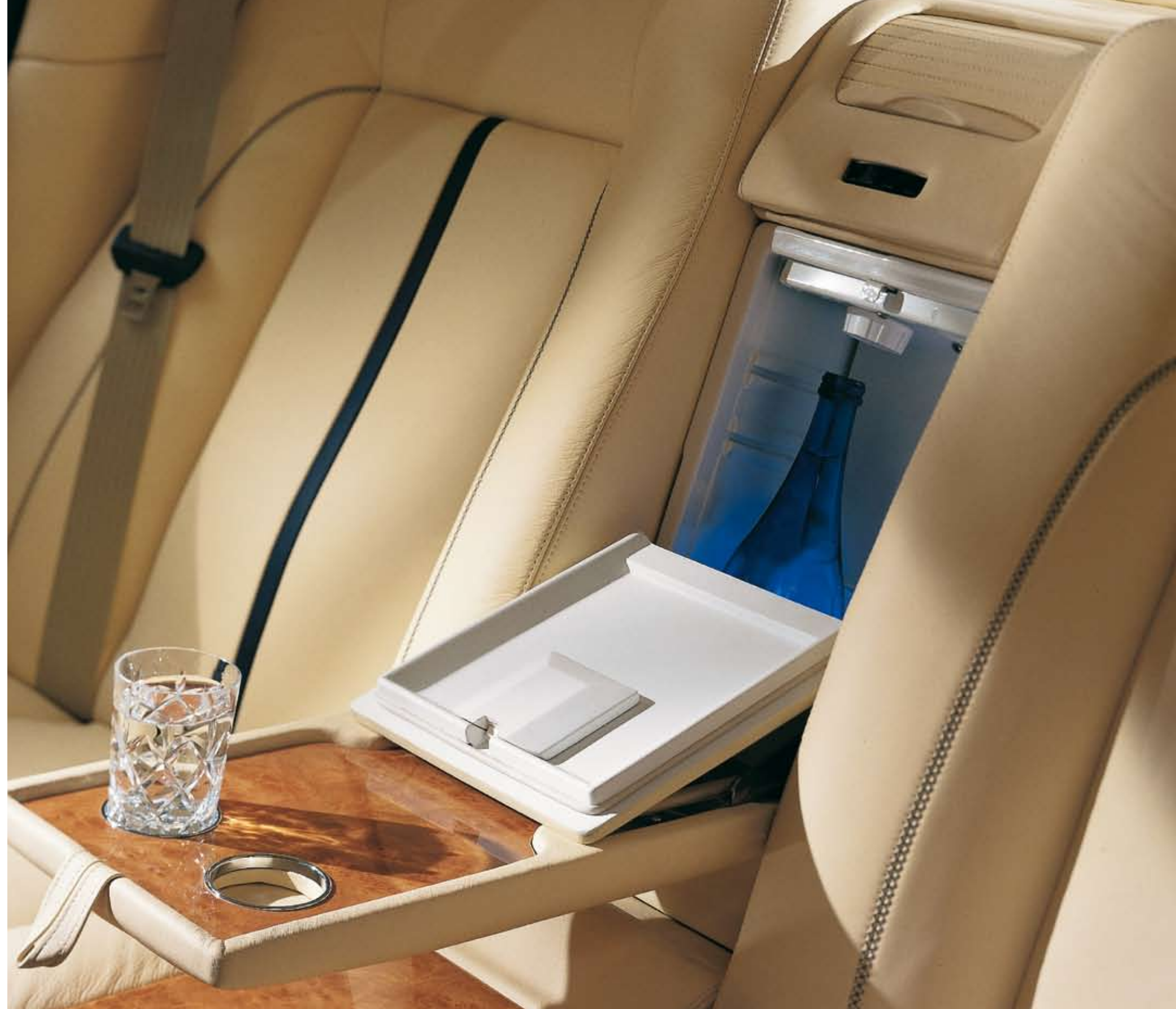
BOTTLE COOLER TO REAR CENTRE ARMREST WITH BESPOKE DRINKS HOLDERS