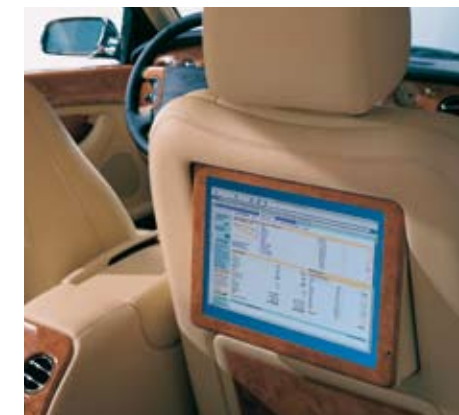
OFFICE COMPUTER SYSTEM TO REAR COMPARTMENT*