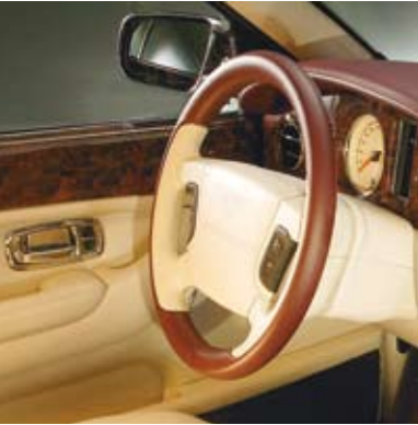
arnage with two-tone hide-trimmed multi-function steering wheel (interior shown is burgundy and magnolia hide with burr walnut veneer)