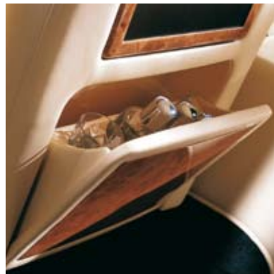
COCKTAIL COMPARTMENT - VENEER