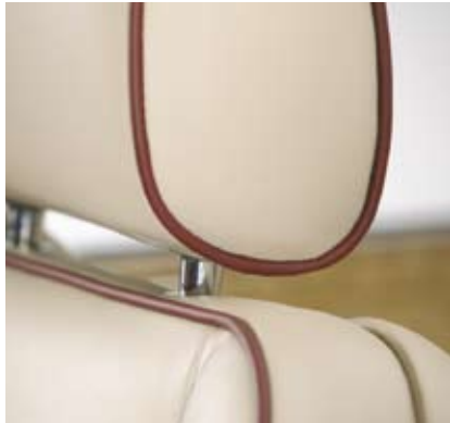
contrast piping to headrest and seat