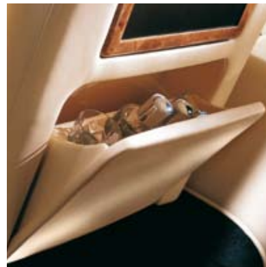
COCKTAIL COMPARTMENT - HIDE