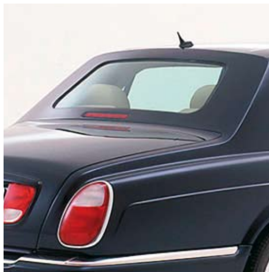
PRIVACY REAR WINDOW