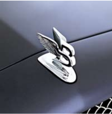
RETRACTABLE FLYING 'B' RADIATOR MASCOT