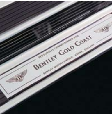
PERSONALISED TREAD PLATE PLAQUE