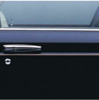
FINE LINES TO EXTERIOR BODYWORK