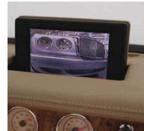
REVERSING CAMERA DISPLAY