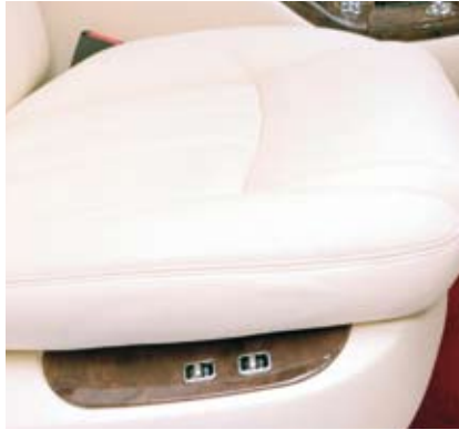
extended front seat cushion**