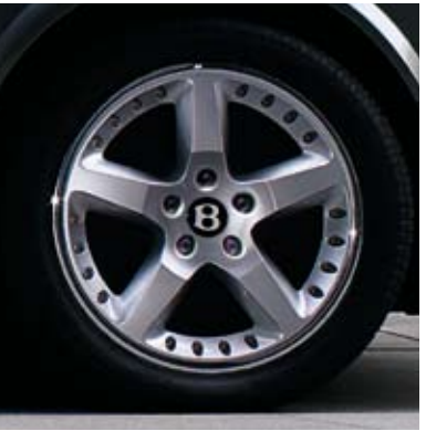
19"x8| 5-SPOKE 2-PIECE SPORTS 'BLADE' ALUMINIUM ALLOY (PAINTED)