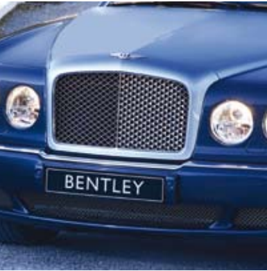
DUOTONE PAINT COMBINATION