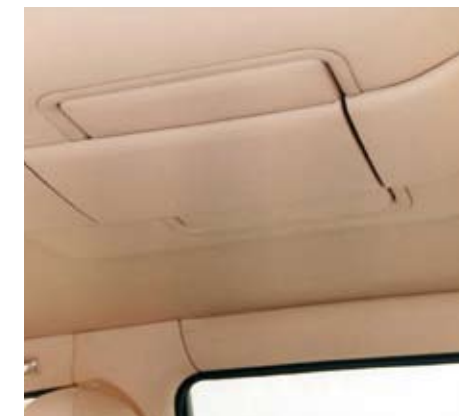
POWER-FOLD DVD & TV SCREEN STOWS IN ROOF PANEL*