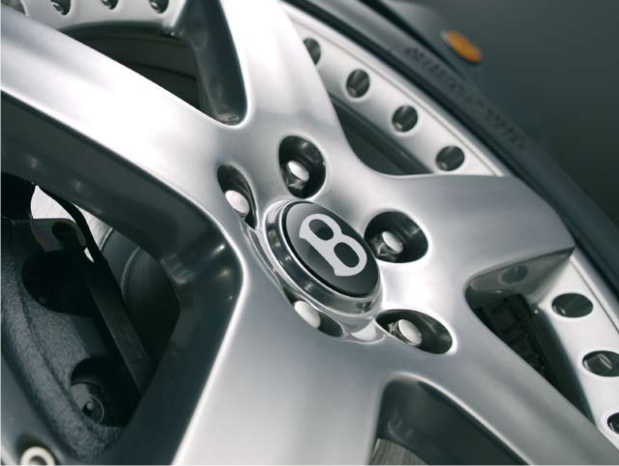
19"x8| 5-SPOKE 2-PIECE 'STAR' ALUMINIUM ALLOY (POLISHED)