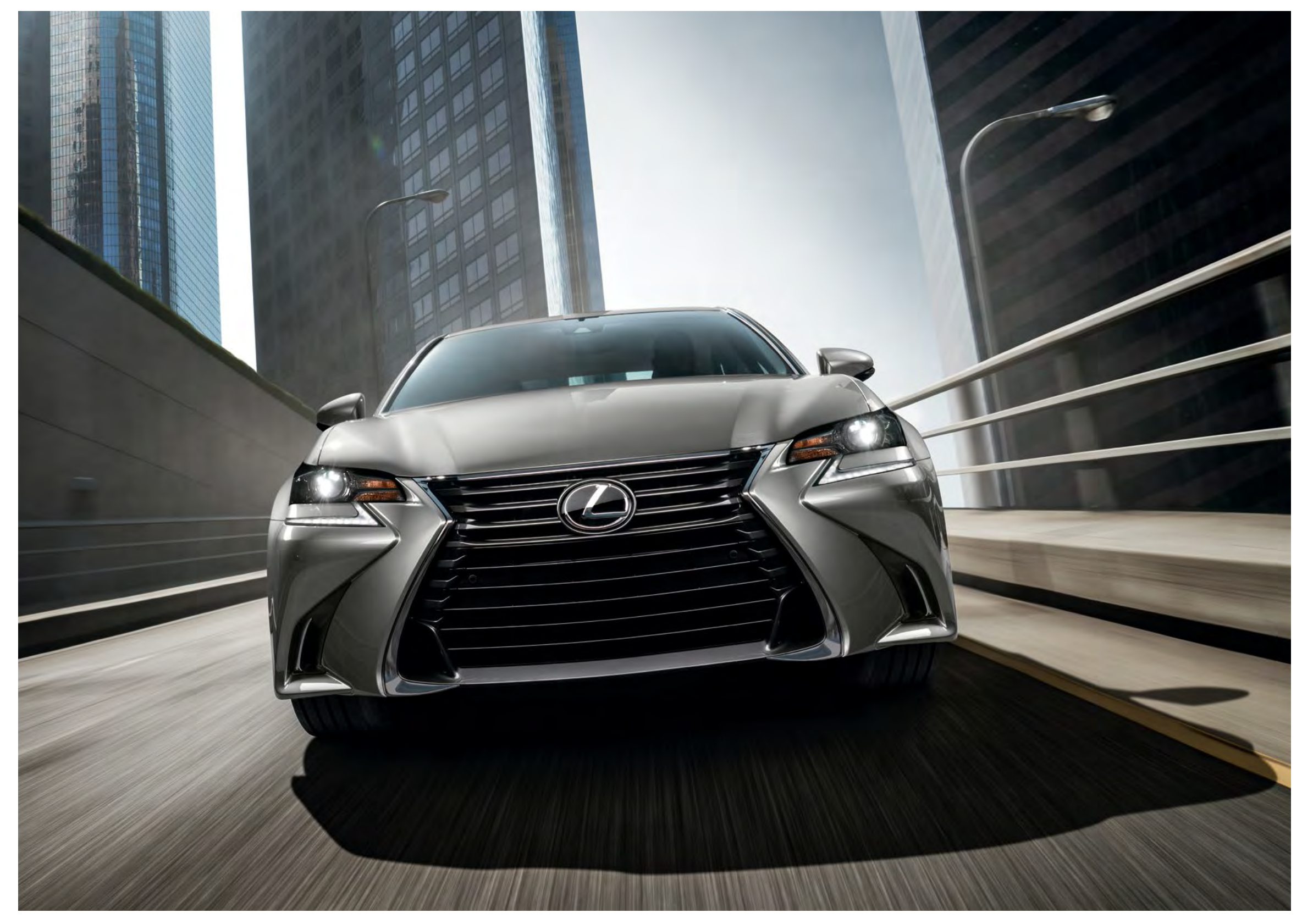
Speed metal has never sounded so smooth. Enhanced body rigidity and a new lateral performance damper (GS 350 RWD) deliver a strikingly agile yet refined ride.