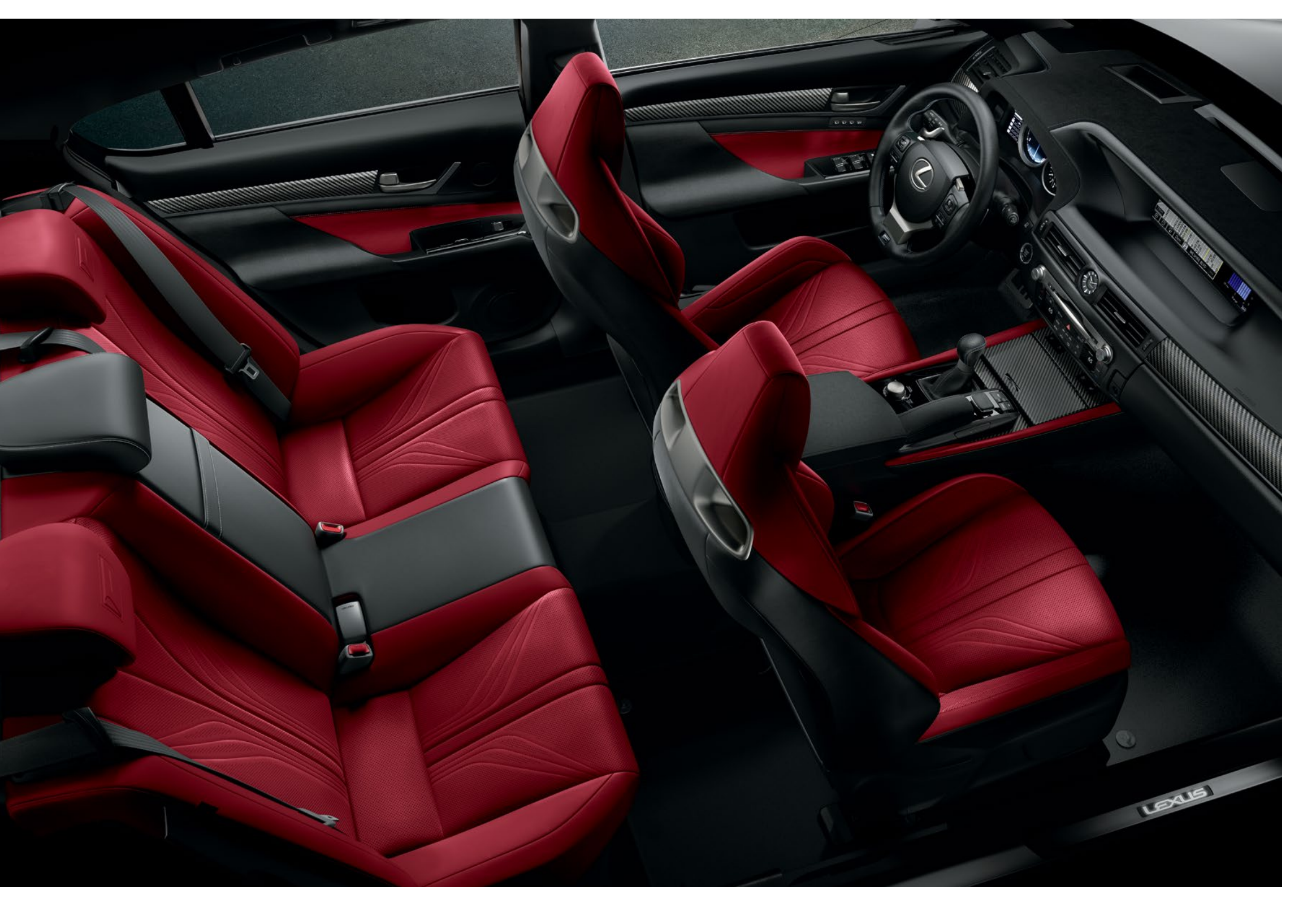
\mathsf{GSF} shown with Circuit Red leather and Black Carbon Fiber interior trim // Options shown