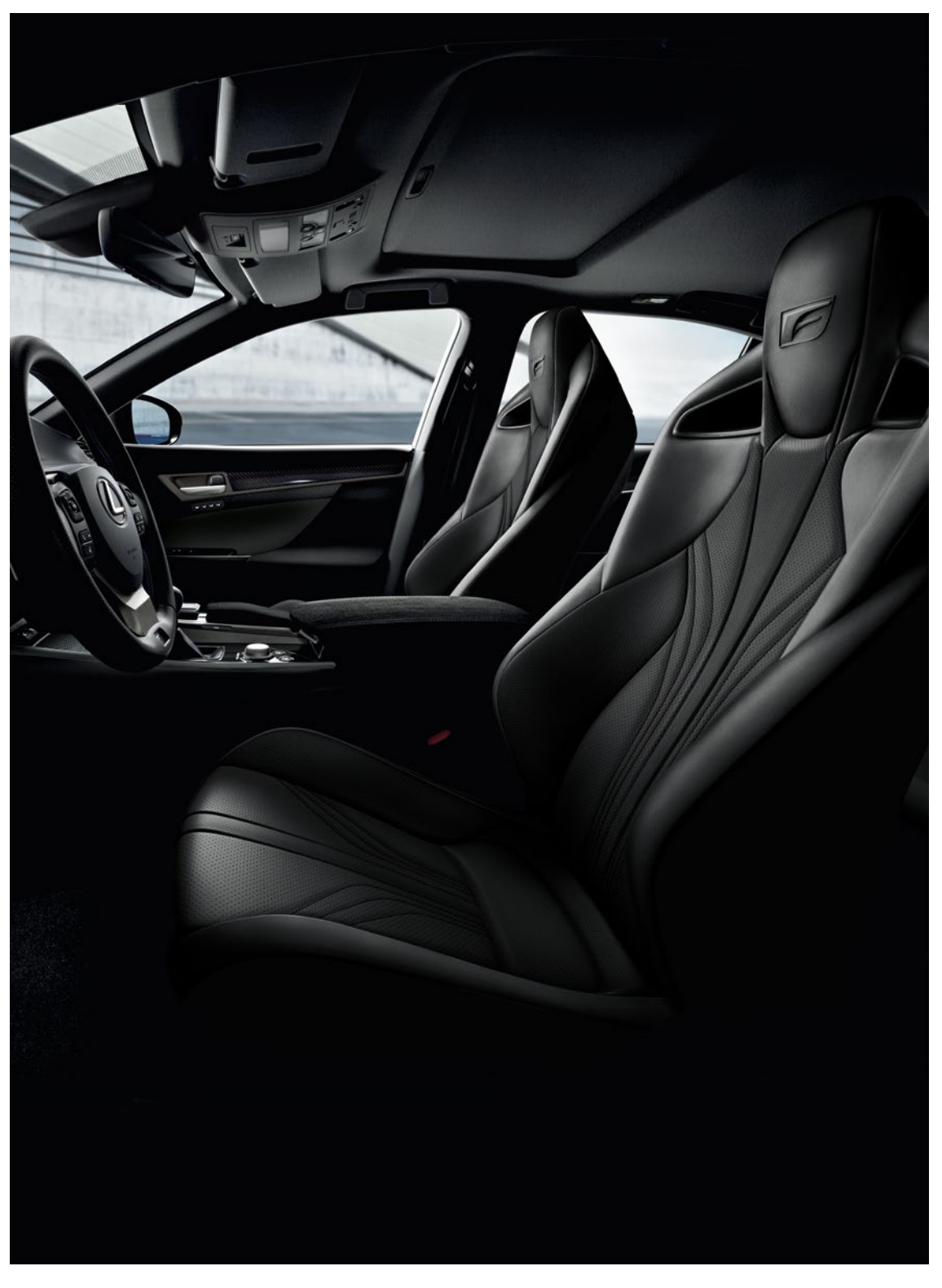
GSF shown with Black leather and Black Carbon Fiber interior trim // Options shown