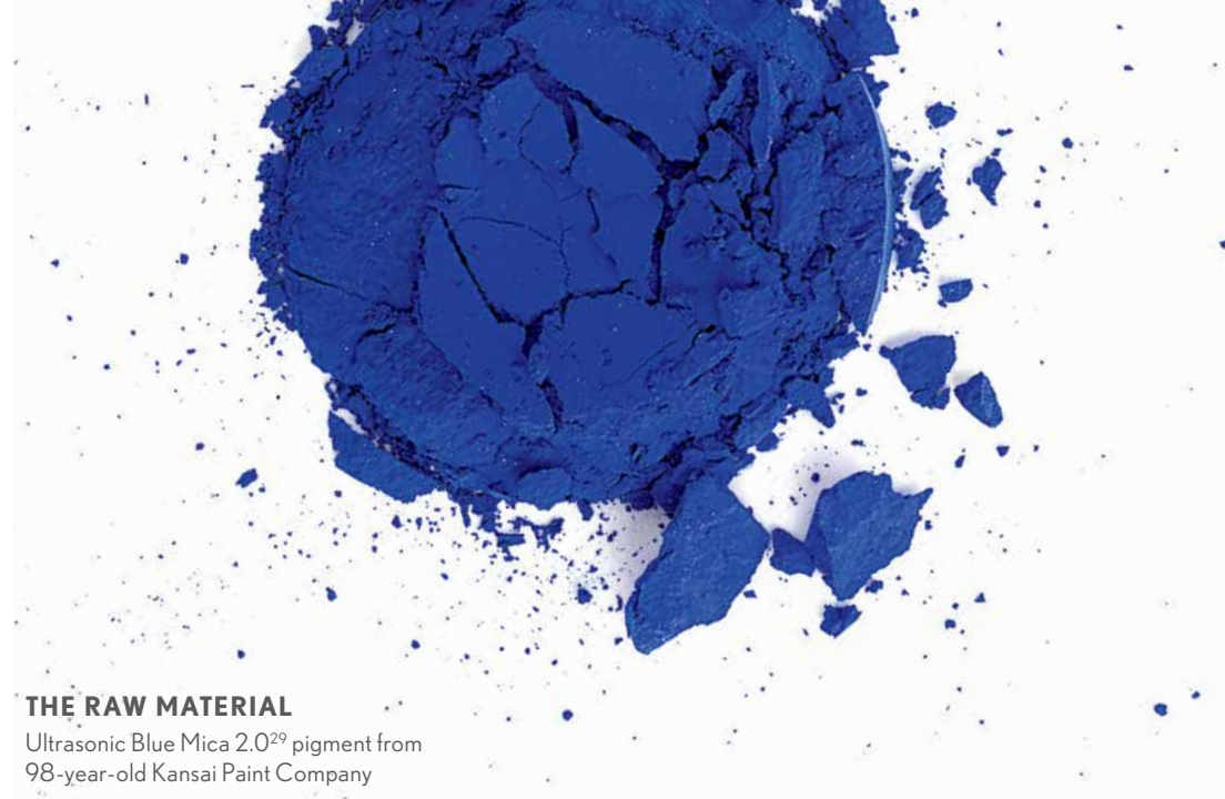
THE RAW MATERIAL Ultrasonic Blue Mica 2.0 29 pigment from 98-year-old Kansai Paint Company