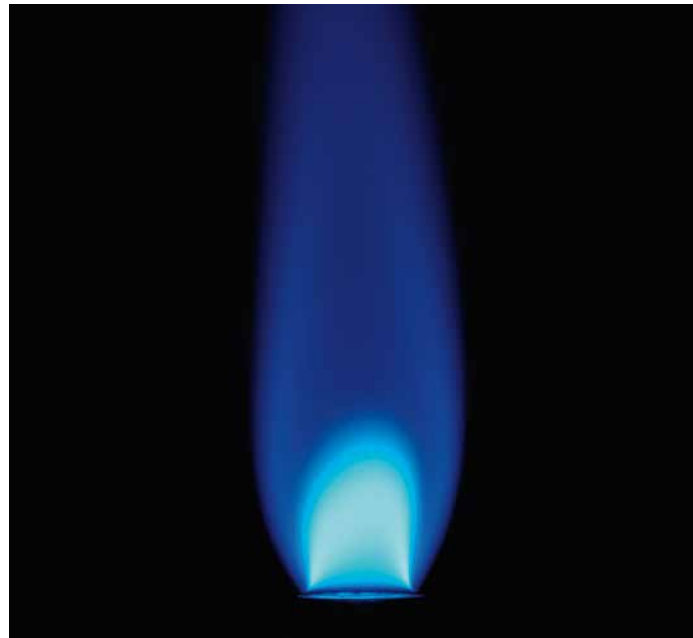
THE INSPIRATION A 1,500°C blue flame