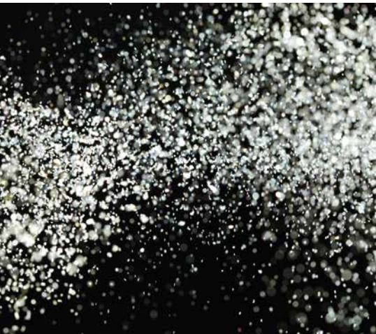
THE METHOD SONIC paint technology aligns the angles of reflective particles for uniform reflectivity