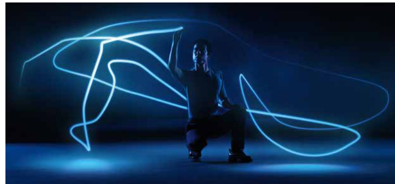
THE APPRENTICE Lexus mapped the painting motions of a master craftsman in order to duplicate the technique with robots