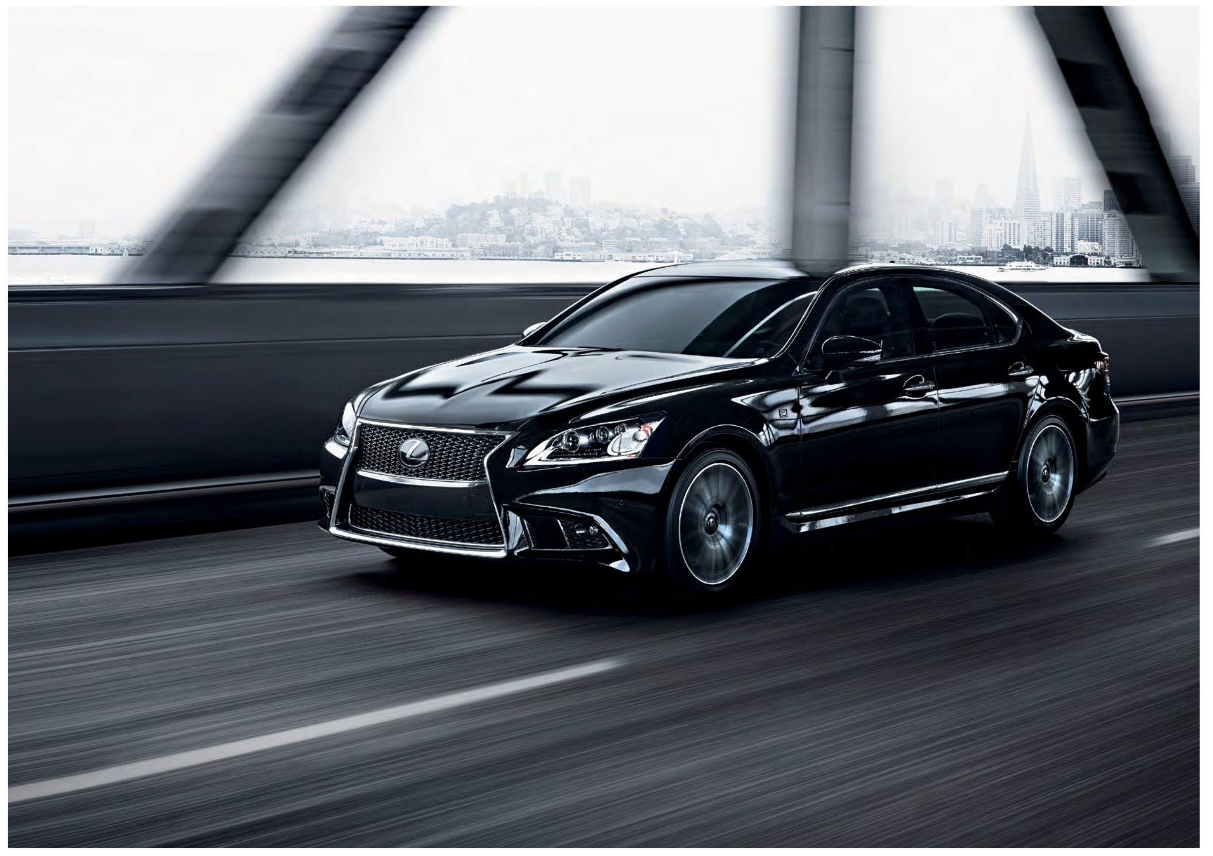
With exclusive performance upgrades including a limited-slip rear differential (RWD) and Brembo front brakes,<sup>4</sup> the LSF SPORT is engineered to take driving exhilaration to the next level.