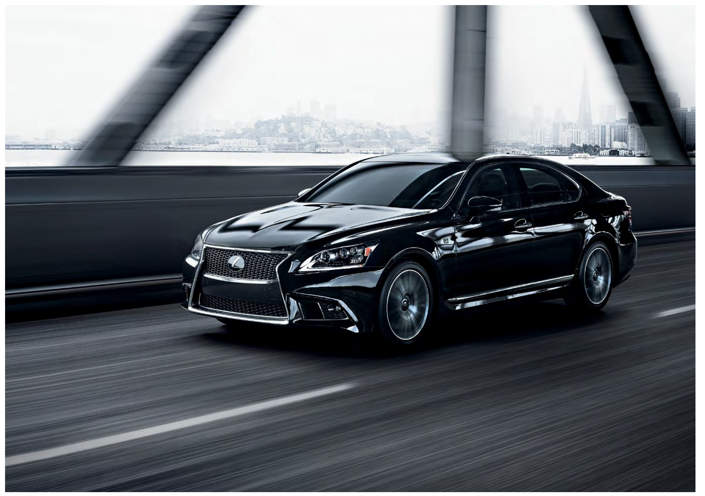
With exclusive performance upgrades including a limited-slip rear differential (RWD) and Brembo front brakes, the LSF SPORT is engineered to take driving exhilaration to the next level.