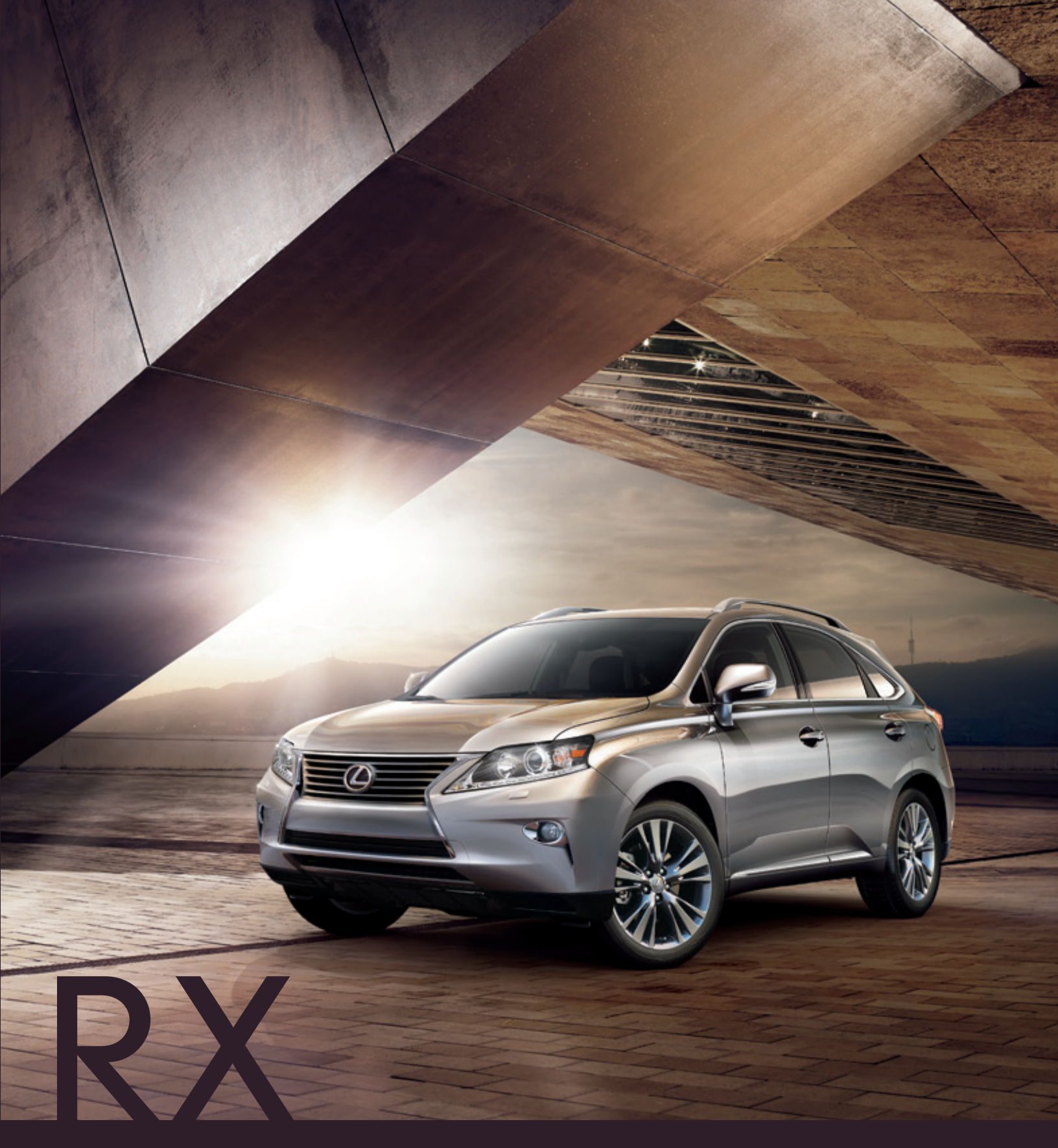
LEXUS | 2013