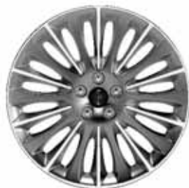
19" Polished Aluminum with Painted Pockets Preferred