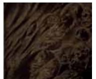
Hazelnut Leather with Prussian Burl Wood Available with 1, 2, 5, 9