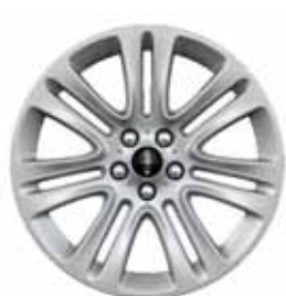
18" Premium Painted Aluminum Premiere

Visit accessories.lincoln.com to shop the complete collection.