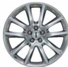
19" 10-Spoke Polished Aluminum Select or Reserve