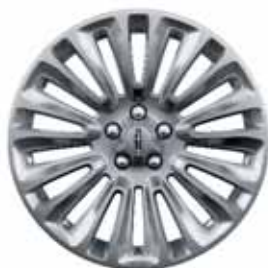
19" 18-Spoke Polished Aluminum Select or Reserve