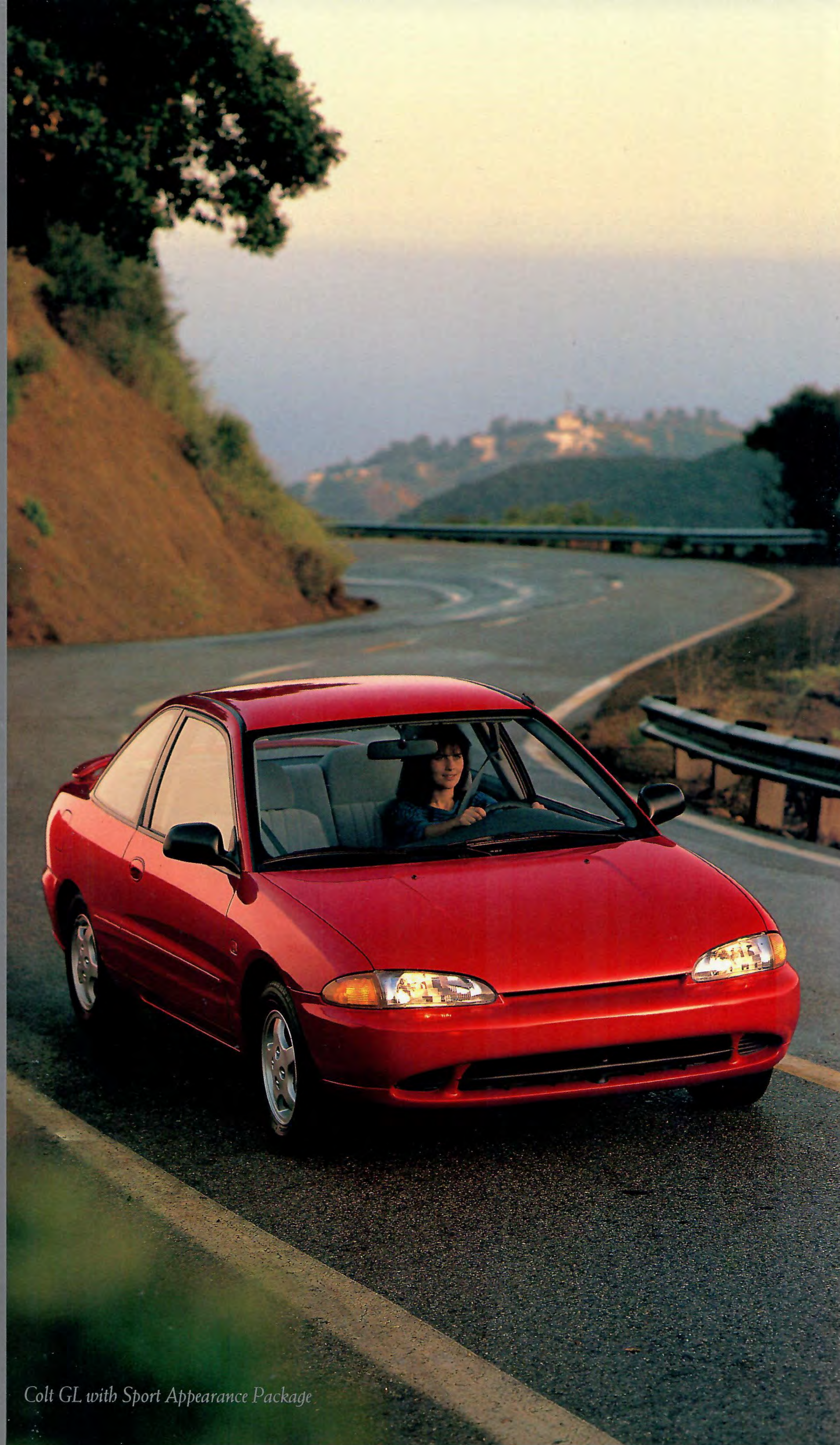
Colt GL with Sport Appearance Package

IMAGINATIVE NEW STYLING AND SOLID ENGINEERING