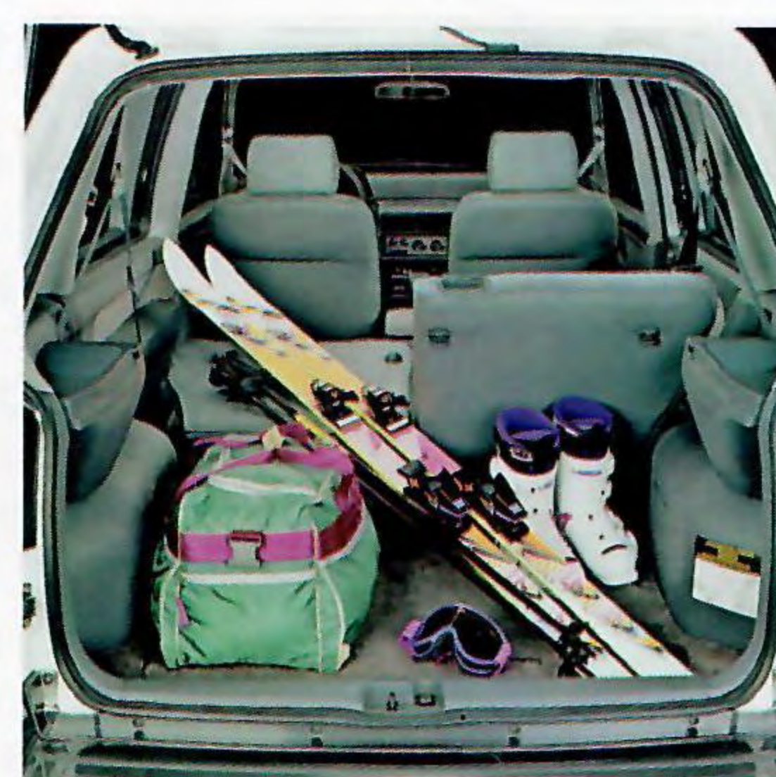
Split-back rear bench seat allows room for long cargo (see page 11 for availability). New pull handle makes the liftgate easy to close.

Colt Vista wagon's lively performance is inspired by a 1.8-liter 16-valve SOHC MPI engine teamed with a five-speed manual overdrive transaxle, both standard on Vista FWD and AWD models. A 2.4-liter 16-valve SOHC MPI engine is standard on Vista SE FWD