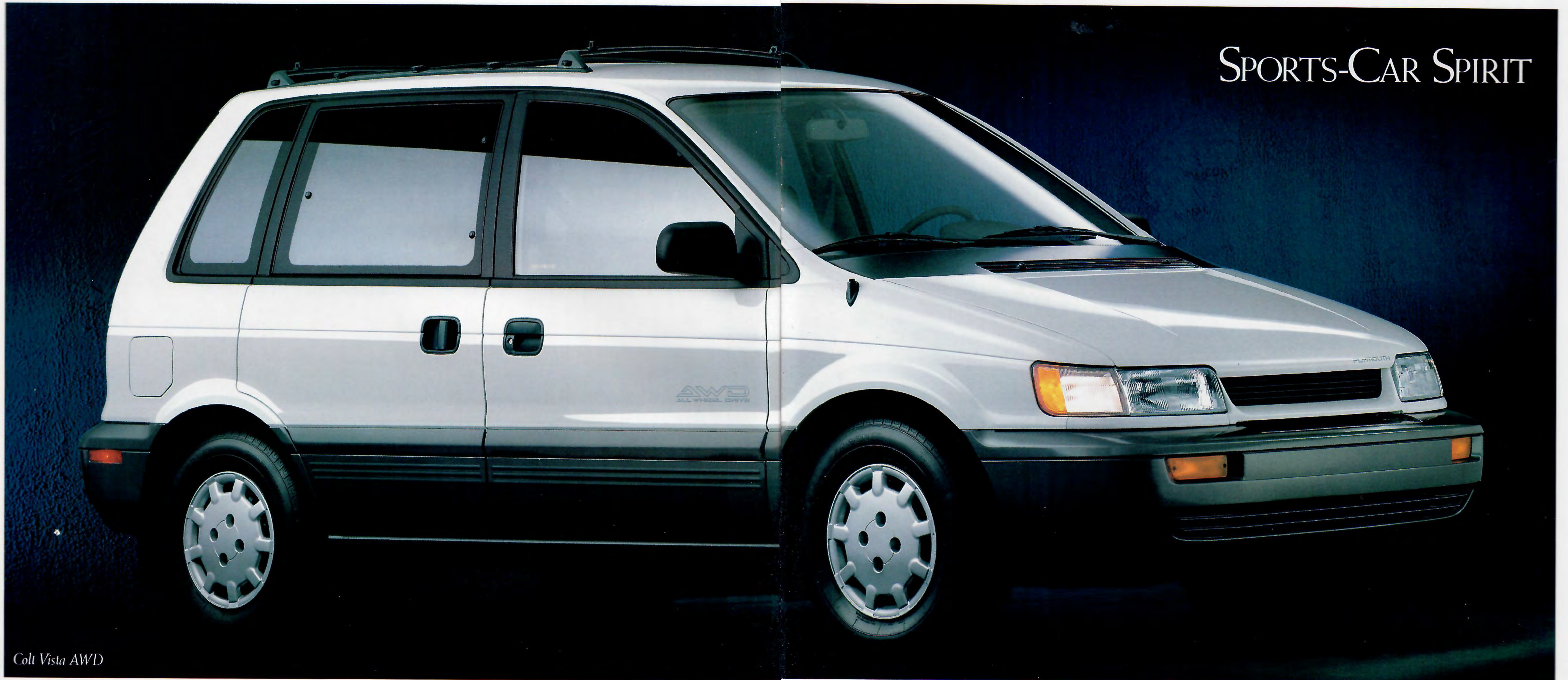
Colt Vista AWD