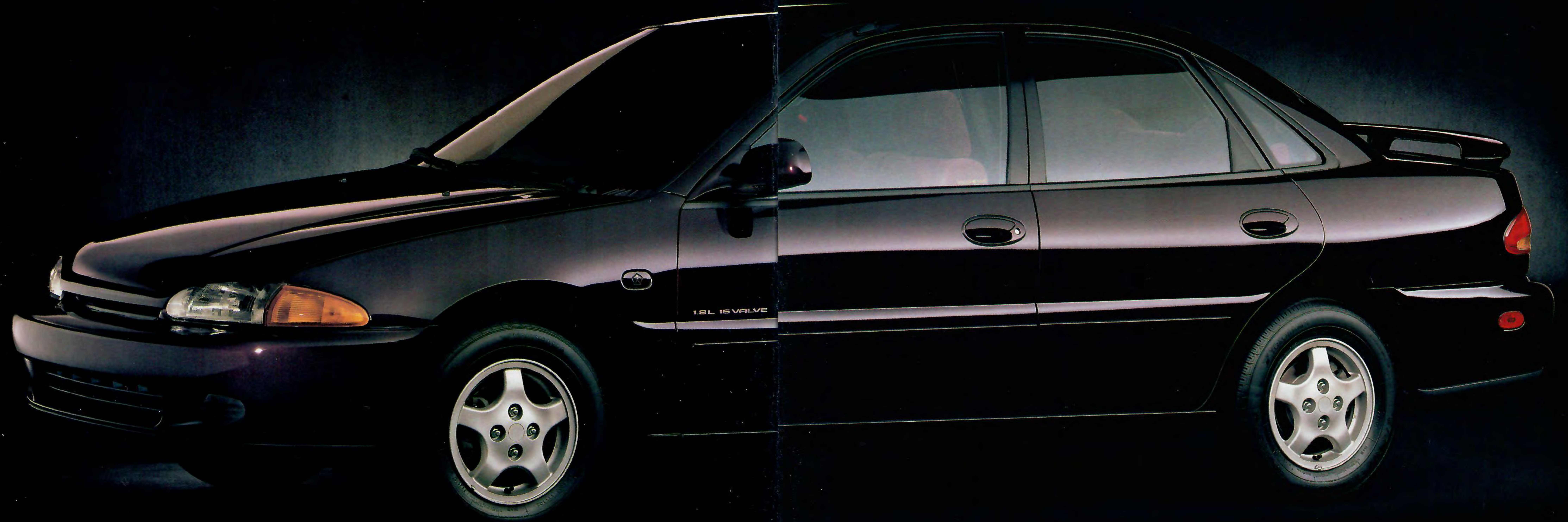
Colt GL with Sport Appearance Package