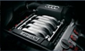
Above: Models of effective yet efficient power, both the V8 and the W12 are largely hand built and are extensively tested before delivery.