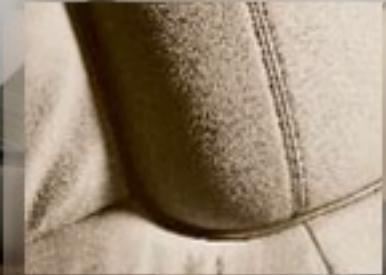
Above: The leather in every A8 both wears well and is comforting to the touch. No chemicals are used in the tanning process.