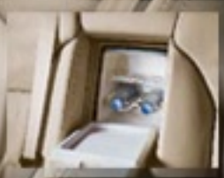
Left: A8 L W12 with optional refrigerator shown. This option is also available on the A8 L.

The Audi A8 L W12: Choosing the car is the easy part. Making it yours alone – a delightful challenge.