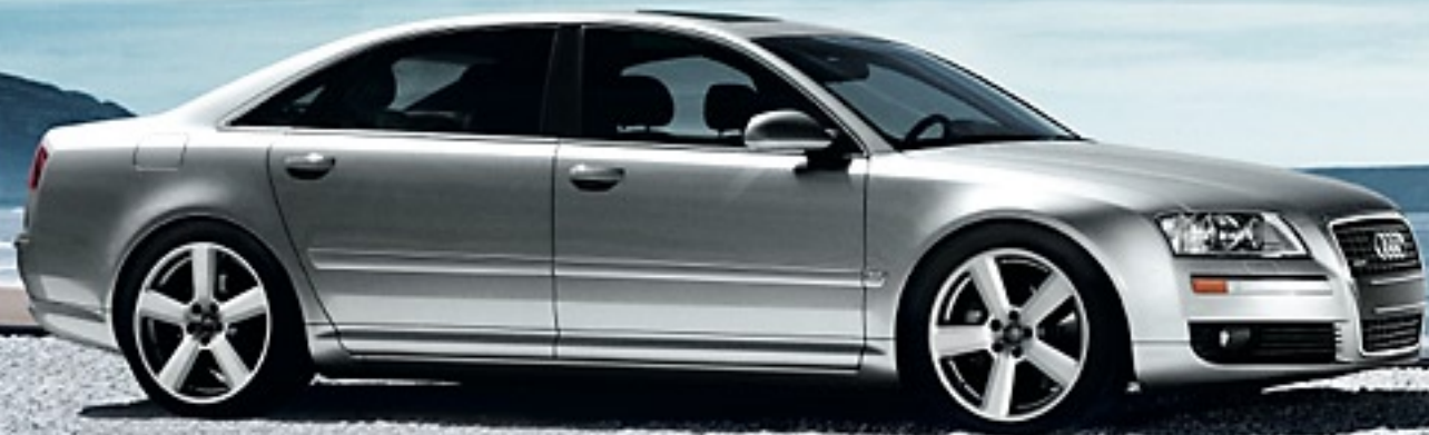
Audi A8 L with optional equipment shown.