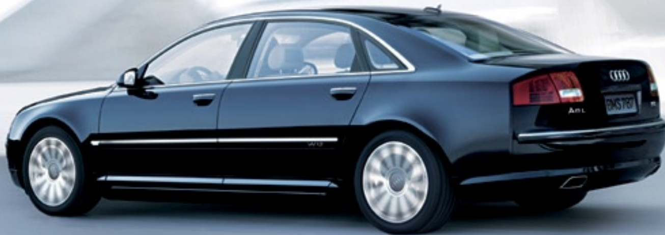
Audi A8 L W12 shown.

With effortless power from its compact, lightweight 12-cylinder engine, the 2007 A8 L W12 invites sports sedan comparisons with every depression of the right foot. Size aside, the flagship of our fleet sports a coupe-like grace that's proving all but irresistible to automotive connoisseurs the world over. Press the start button, hear all 12 cylinders spring to life and it's easy to both see and hear why. It's a sound that's both unmistakable and inviting. With a look that speaks volumes. And the feeling behind the wheel? Let's just say a test-drive is beyond demonstrative. It's imperative.