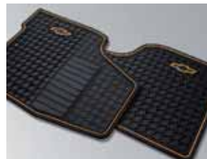
All-weather front floor mats