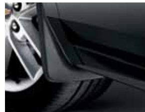
Molded front splash guards