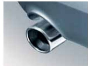
Polished stainless steel exhaust tip

1 Extra-cost color. Not available on LS.