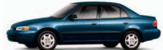
Dark Blue-Green Metallic