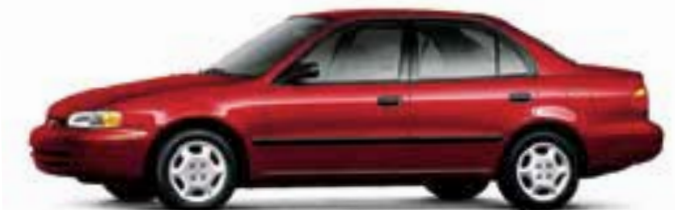
Medium Red Metallic