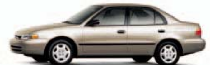
Cashmere Taupe Metallic