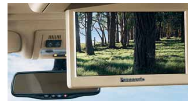
Change "Are we there yet?" to "Can we circle the block?" with the available DVD entertainment system. The system offers an 8-inch-diagonal monitor that can entertain the pickiest backseat driver.