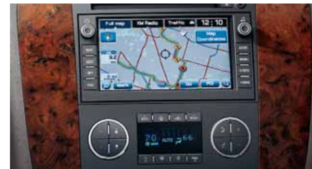
The available touch-screen navigation radio 4 includes a 6.5-inch-diagonal color display. Standard on LTZ.

The patriarch of family vehicles, Suburban is the SUV designed to carry both cargo and people. It's utilitarian, but what's most useful is its ability to keep you comfortable and entertained. Whether you're enjoying standard XM RADIO 1 with three trial months or the 360-degree listening experience of the Bose® Centerpoint® Surround Sound system – standard on LTZ – Suburban puts you center stage. Keeping cool or warming up is easy with LTZ since it comes with standard HEATED AND COOLED FRONT BUCKET SEATS ; heated, second-row leather-appointed bucket seats; and a third row that features a three-person, stadium-style bench seat. And the greatest comfort is knowing you'll have help getting where you want to go with OnStar 2 standard for the first year and TURN-BY-TURN NAVIGATION 3 included in the Directions & Connections Plan (standard on LT and LTZ). Simply press the OnStar button and tell an Advisor where you need to go. The route will be downloaded to your Suburban while an automated voice guides you through every turn until you get to your destination.