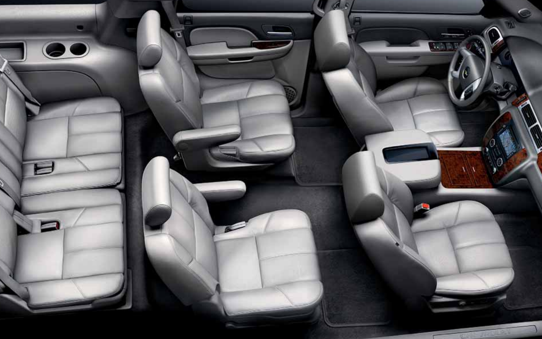
Suburban half-ton LTZ 4WD interior in Titanium color with available features and leather-appointed seating surfaces. 1 XM Radio requires a subscription, sold separately by XM after trial period. XM Radio U.S. service only available in the 48 contiguous United States and the District of Columbia. For more information, visit gm.xmradio.com . 2 Call 1-888-4ONSTAR (1-888-466-7827), see page 14 and visit onstar.com for details and system limitations. 3 Not available in certain areas. Visit onstar.com for coverage map. 4 Map coverage excludes Puerto Rico, the Virgin Islands and portions of Canada. 5 Go to gm.com/bluetooth to find out which phones are compatible with the vehicle.