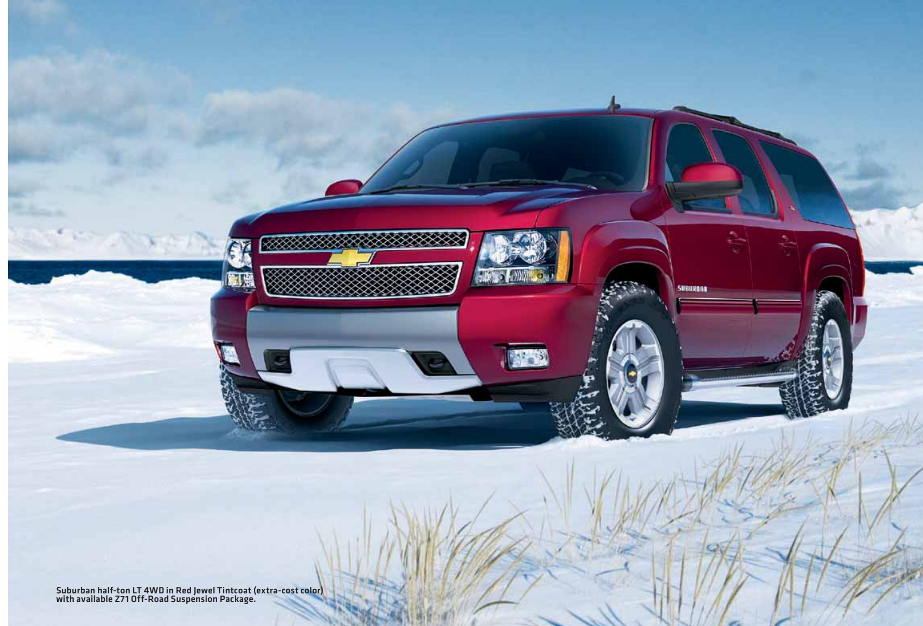
Suburban half-ton LT 4WD in Red Jewel Tintcoat (extra-cost color) with available Z71 Off-Road Suspension Package.