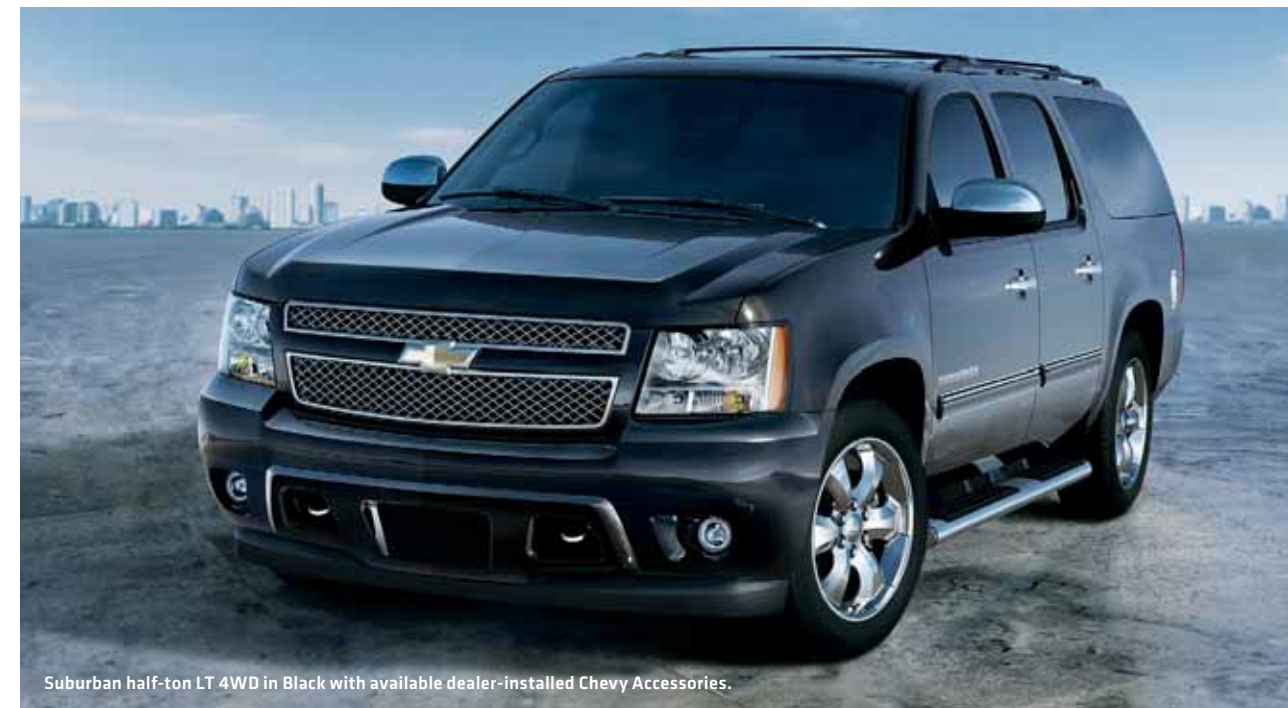
Suburban half-ton LT 4WD in Black with available dealer-installed Chevy Accessories.