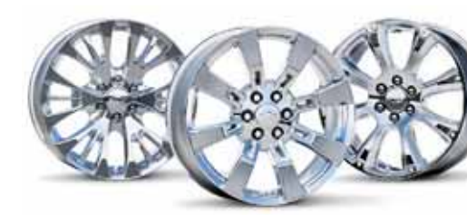
22" chrome wheels! 1