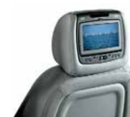
Head-restraint DVD system.