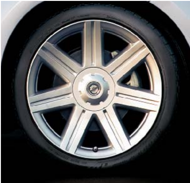
A) 18-inch front; 19-inch rear Satin Silver aluminum wheels, standard on Crossfire and Crossfire Limited.

For more information, please visit www.chrysler.com/crossfire