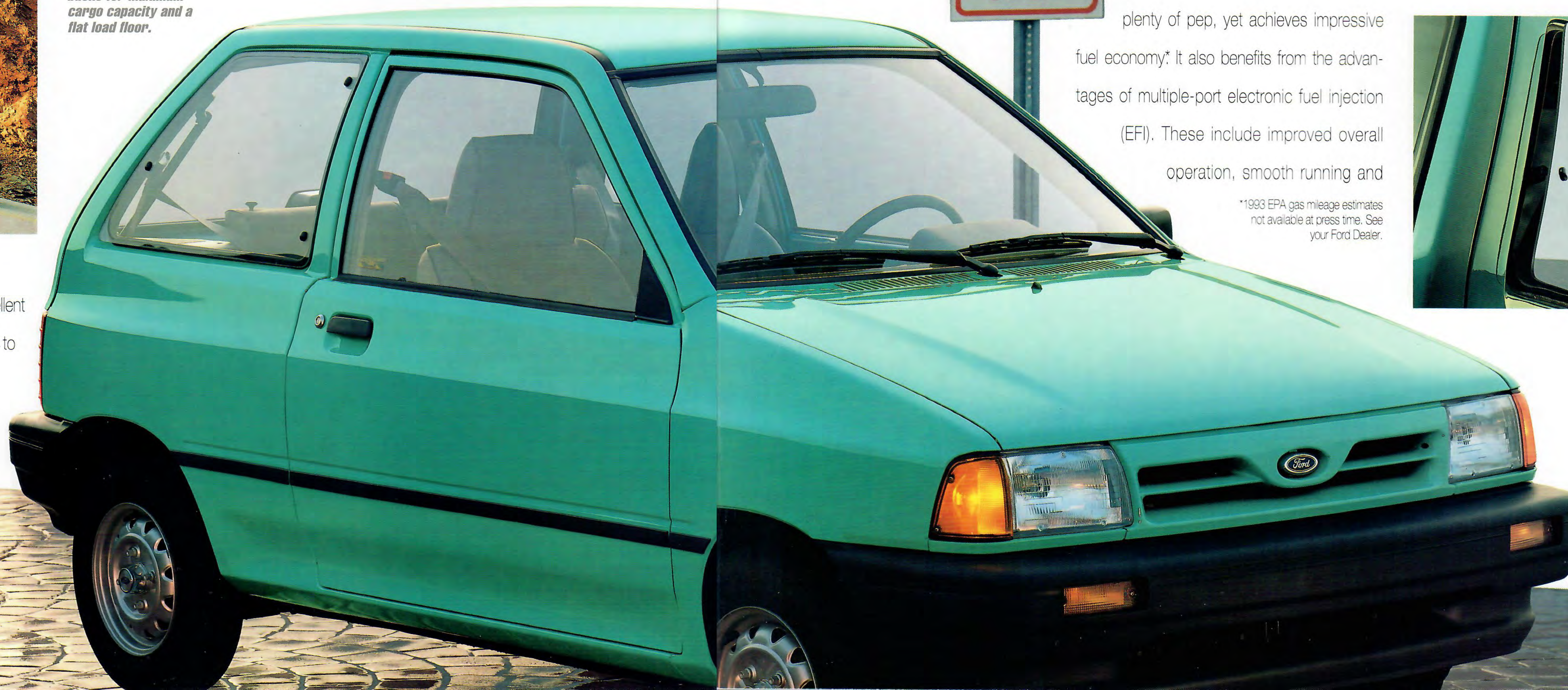
Festiva L shown in Aqua.

On the performance side, Festiva's excellent driving characteristics can be attributed to