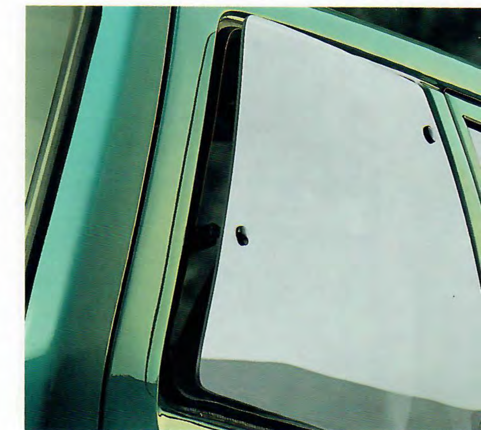
Festiva's rear quarter windows open for enhanced ventilation.

Festiva's 5-speed manual transaxle includes an overdrive fifth gear that serves to enhance highway fuel economy. An optional 3-speed automatic transaxle is available with Festiva GL.