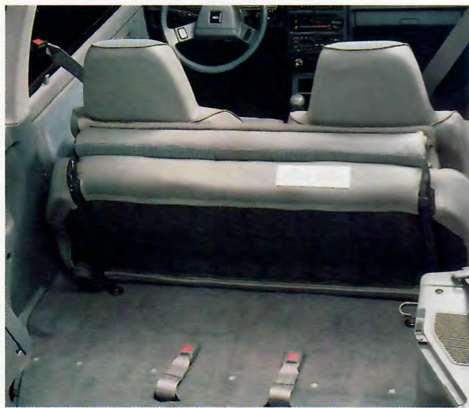
Festiva's entire rear seat assembly can be folded up toward the front seat backs for maximum cargo capacity and a flat load floor.

several key engineering decisions, not the least of which was to give Festiva front-wheel-drive.