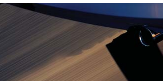
Accord Hybrid shown in Silver Frost Metallic.